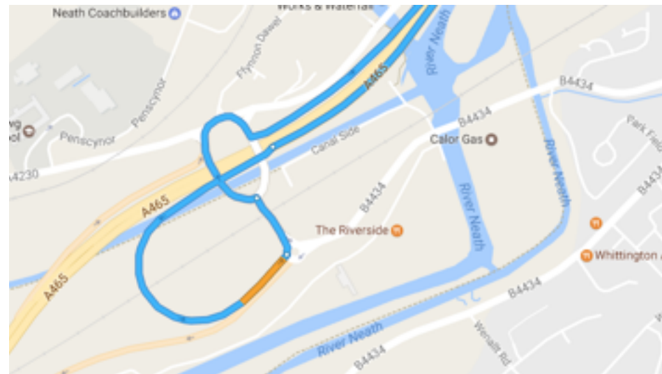
R25/3H Course layout https://www.strava.com/segments/11777401