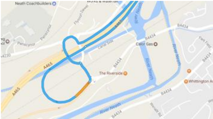
R25/3H Course layout https://www.strava.com/segments/11777401