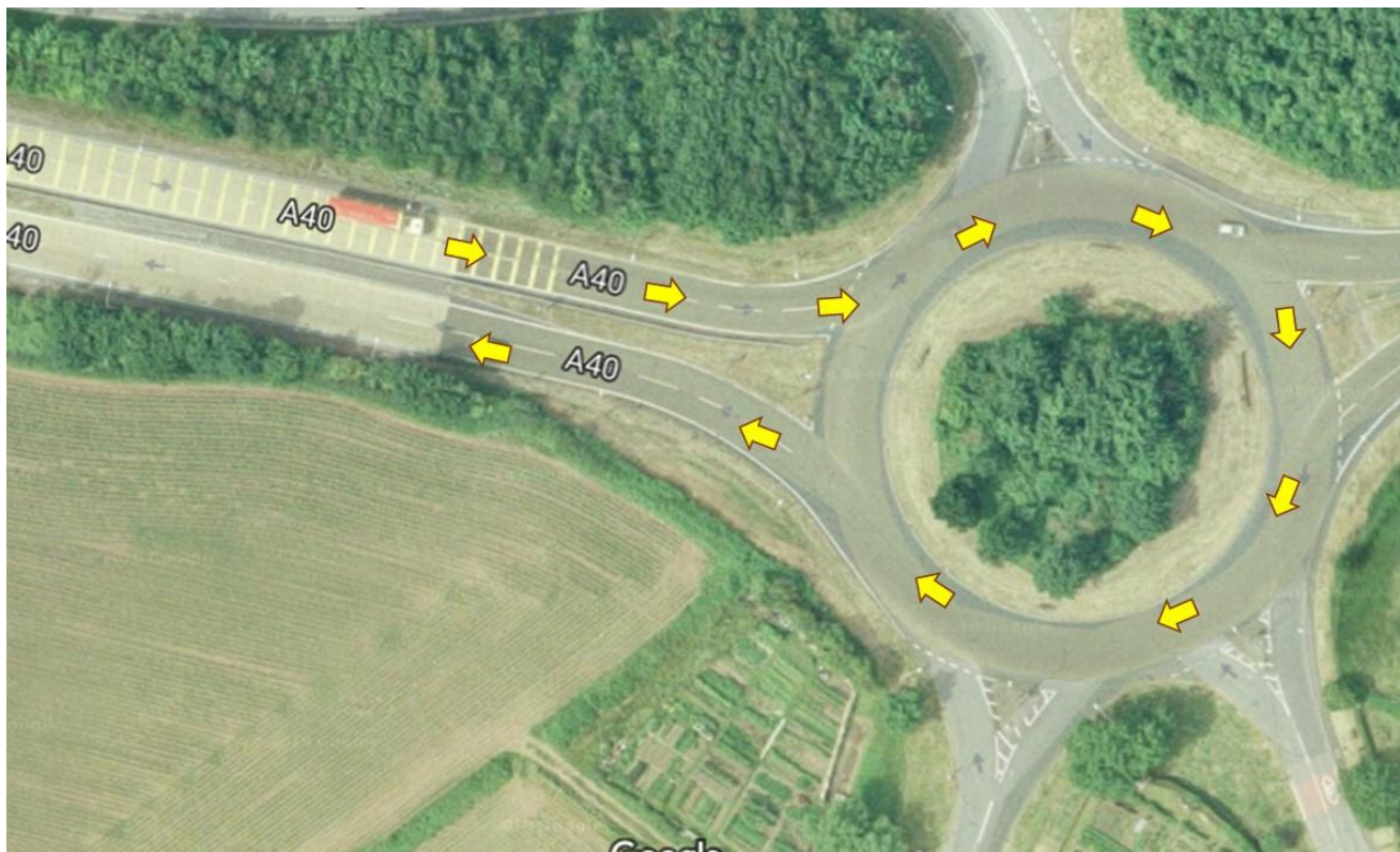
Aerial view of the turning point at 4.94 miles

We'll have marshals stationed at the turning point but please remember that they're there for guidance only and have no authority to control traffic. The R10/17 is a simple out-and-back course but several roads converge at the turning point, as shown here: