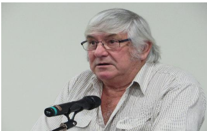
Our own Bush Poet.