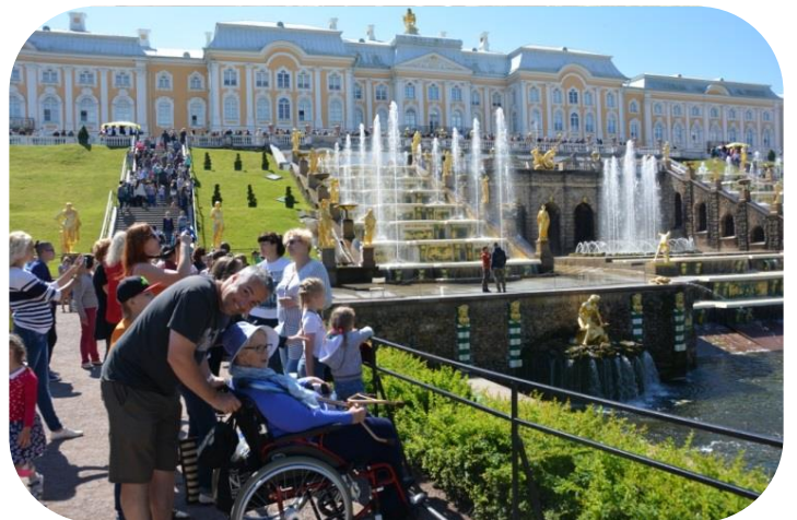
The Great Peterhof Palace St Petersburg