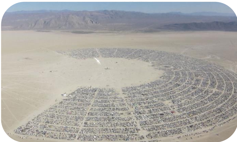
Burning Man Festival Site