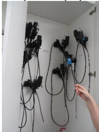
A Scope for all purposes