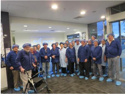
Kitted up and ready to go.