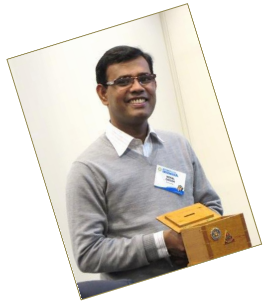
New Dad collecting to pay the bills