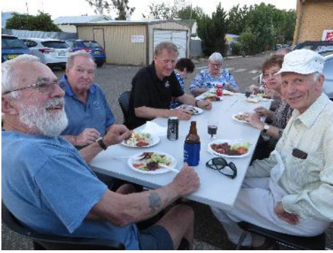
Members enjoying the BBQ following the book-sort.