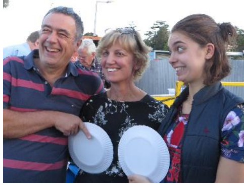
The Smart Family – doing what the Smart Family do best.