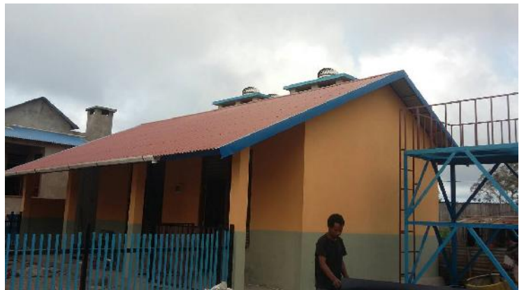
Our Tutuala Project nears completion.