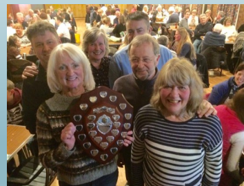
Whips, Spurs & Prosecco celebrate their quiz night victory!

The evening raised over £700 for Kesteven RDA, an excellent start to the fundraising year. Huge thanks to everyone who took part and we look forward to seeing you all again next year.