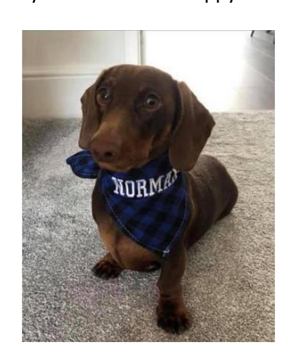
Norman – Cutest Puppy