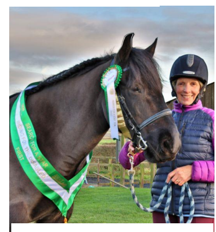
Lemonsholme Prince (aks Rio) with his SEIB Search for a Star 2020 winner's rosette and sash

We were also nominated for the SEIB RDA Centre of the Year Award and learned in May 2021 that we had been shortlisted. The results were announced at a lunch held at the Dallas Burston Polo Club, Southam, Warwickshire. We didn't win but did receive a very nice plaque to celebrate that we had been shortlisted.