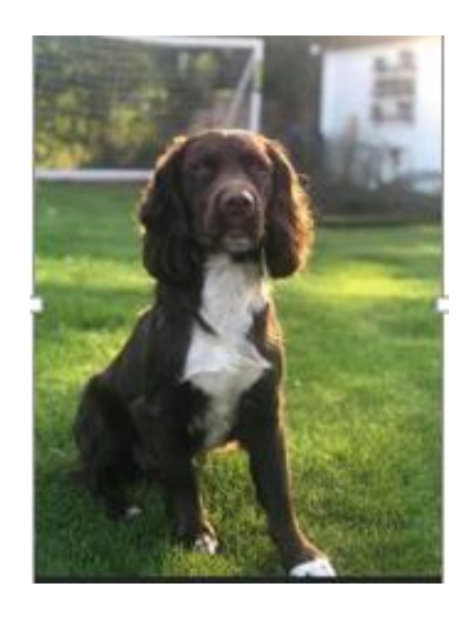
Ronnie - Best in Show

We hoped this would help to keep our supporters engaged during very tough times when it was hard to physically keep in contact with everyone. There was no entry fee. It was all for fun. Our best in Show was Ronnie whilst the Prettiest Bitch was Lolly and the Cutest Puppy was Norman.