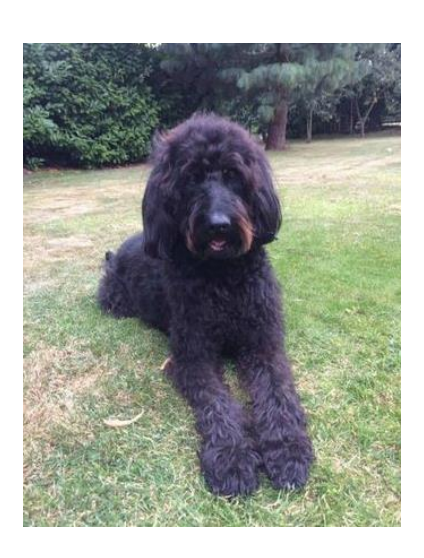
Lolly - Prettiest Bitch