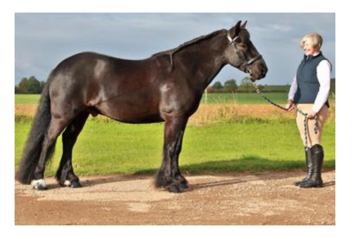
Our submitted photograph of Lemonsholme Prince (aka Rio) for the SEIB Search for a Star 2020 competition.

We were also nominated for the SEIB RDA Centre of the Year Award and learned in May 2021 that we had been shortlisted. The results were announced at a lunch held at the Dallas Burston Polo Club, Southam, Warwickshire. We didn't win but did receive a very nice plaque to celebrate that we had been shortlisted.