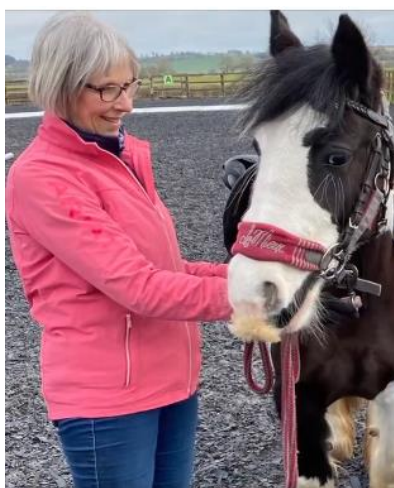
Not forgetting Elsa!