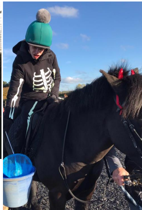
Ooooo a scary skeleton!