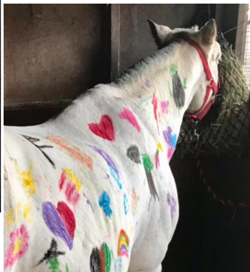
Fudge in his coat of many colours