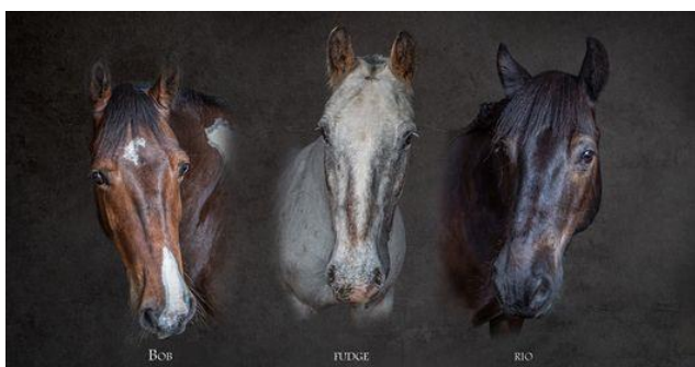
Our RDA ponies: Bob, Fudge & Rio

The group own four ponies: Bob, Fudge, Elsa and Rio and hire other ponies from The Paddocks Livery Centre to help run the sessions. At present we have 19 supporters, 4 of whom are businesses, contributing toward our ponies' board and lodgings through the Pony Angel Scheme. This guarantees a set monthly donation or a discount on services provided.