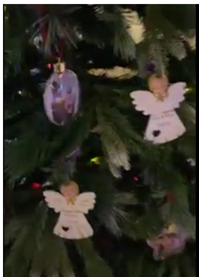
Each of the angels represented one of our pony angel sponsors.