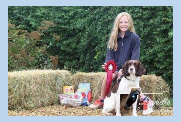
Best in Show