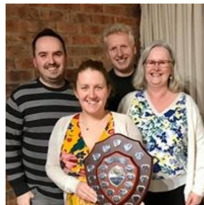
The “Mad Pandas” with their winner’s shield

We raised over £700 which was a very important injection of funds just before we faced the challenges of lockdown.