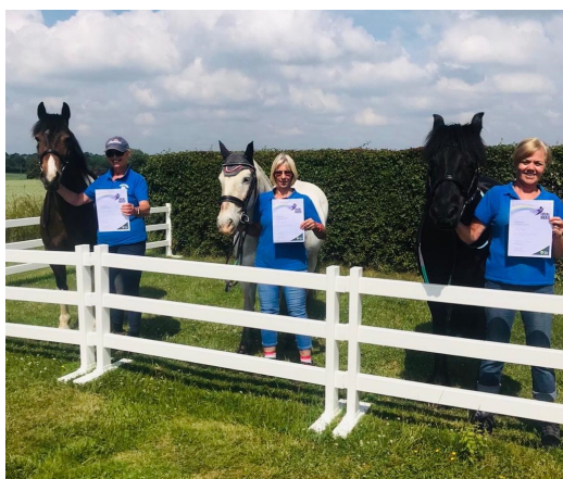
The Kesteven Rideability “Lockdown Team” with their certificate of thanks from South Kesteven Council

This report was followed by coverage of our 2.6 Challenge and then we appeared again as part of a report by the local council about their scheme to publicly thank the many volunteers working through lockdown. Even whilst open many small charities get little press coverage so when groups are more cutoff from their communities press coverage can be even more important as a reminder that they are still there and still ready to help whenever circumstances permit. Many thanks to all those who chose to mention us in their publications.