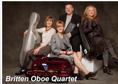
Britten Oboe Quartet