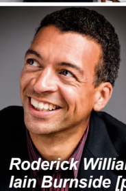
Roderick Williams [baritone] Iain Burnside [piano]