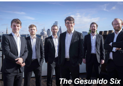
The Gesualdo Six