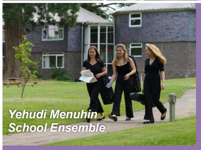
Yehudi Menuhin School Ensemble