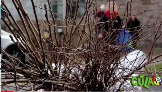
Seachtain na gCrann i TG4 Cúla4

eile acu. Tá ard-mholadh ag dul do Choiste Chumann Beachairí Chonamara a raibh bliain an-ghnóthach acu agus an t-uafás oibre déanta acu. Is láidre muid nuair a sheasann muid ar fad le chéile agus go mba fada buan an cumann.