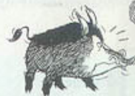
The Wild Boar