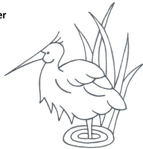
Outline design for transfer

Gather together your materials (see page two for list, or choose from your stash!). Transfer the design provided (below right) onto your chosen fabric (you can trace it or use the Prick and Pounce method) and frame up with the calico backing into your chosen embroidery frame. Use the stitch guide below along with the video to work the 'Little Egret.'