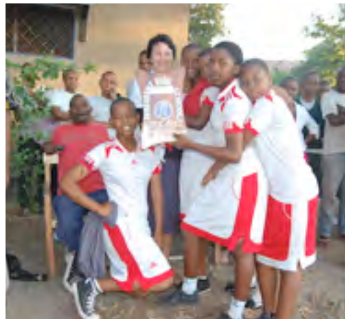
Debrabant Netball Team ▼

on music, art or drama or even P.E. in the present curriculum and unlimited scope exists for developing the huge potential that is there.