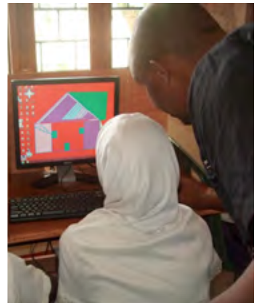
Learning is fun when you have a proper computer and a keen teacher

She came with a case full of footballs, pens, flash discs and much else, but most of all she came with enthusiasm and creativity. She soon had the students and the teachers galvanised to be innovative. The students, most of whom had never touched a computer before, were soon making PowerPoint presentations and inserting pictures of their life at COBET. She helped him to set up the first Coder dojo club in Tanzania and this got us free advertising in a National newspaper. She also encouraged the computer department in Debrabant to get involved in Africa Code week.