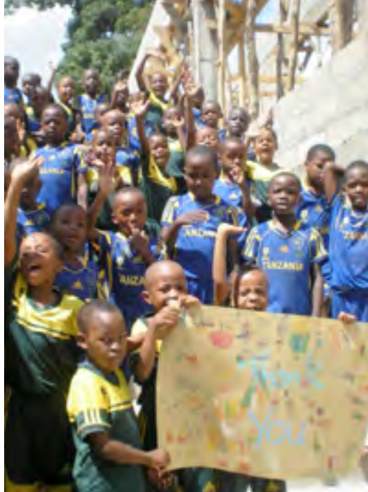
Primary School children say "Thanks"

THE PRIMARY School building programme is still a work in progress. However the framework is now in place – dining hall, kitchen, staff toilets, 6 upper classrooms and offices including the roof.