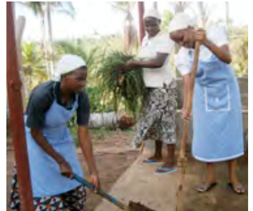
Novices in the Shamba at Dundani

an outreach to the schools and to poor families in the area. The numbers in the Sunday school are increasing and they are involved in the local basic Christian communities. They have a small income from selling water, vegetables and coconuts. They also grow maize, cassava, rice, okra, watermelons and pineapples. They are the proud owners of a growing poultry project of hens and ducks and one cow, called 'Black'.