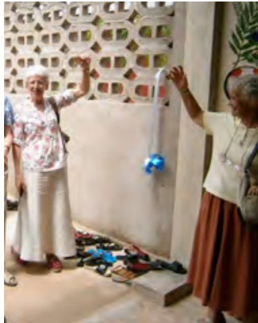
Ceremonial ribbon-cutting at the new 'Banda'

THE numbers of children increase all the time. We now have well over 700 children on the database who have been helped by the Centre. They come and go though, fortunately, they don't all come at the same time. We average over 200 children a week. The exercise hall is now too small