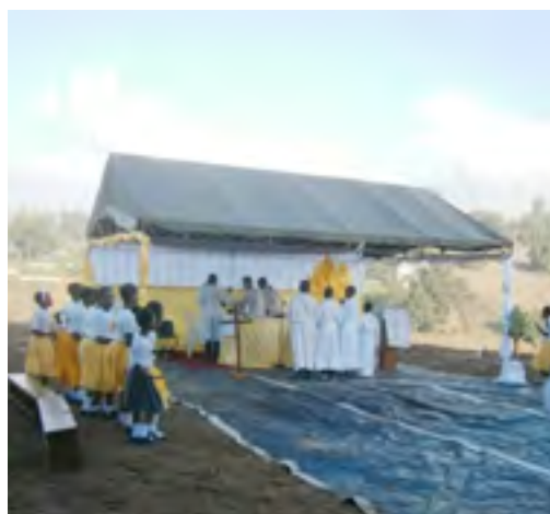
Maji Matitu Church foundation ceremony

The Church is surely thriving here in Tanzania. Let us pray that vocations keep pace.