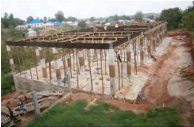
▲ Work in progress: school dining hall