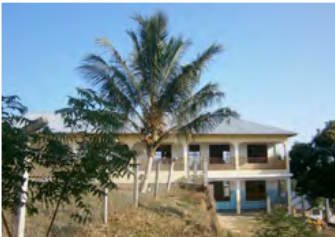
▼ Work complete: phase one classroom block

A new borehole produces plentiful good drinking water. With the funding available we have done more than anticipated, but there is still much to be done – plastering, painting, tiling, paving, as well as building a storage tank for rain water.