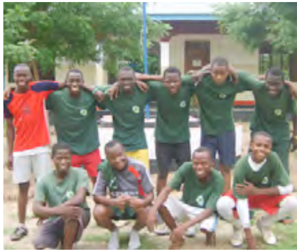
▲ Debrabant Football Team