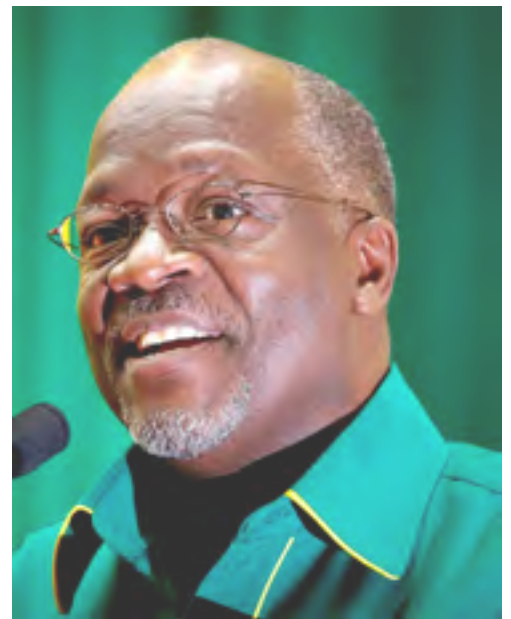
Tanzania President Magufuli

For all that, however, he's causing problems unwittingly as things can't all be done at once. School staffing is worse now as they clamp down on fake certificates, and ghost workers, thousands of them. He announced totally free education but did not send money to the schools to replace what the parents had been contributing.