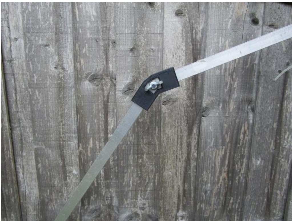
The Rail Corner Brackets