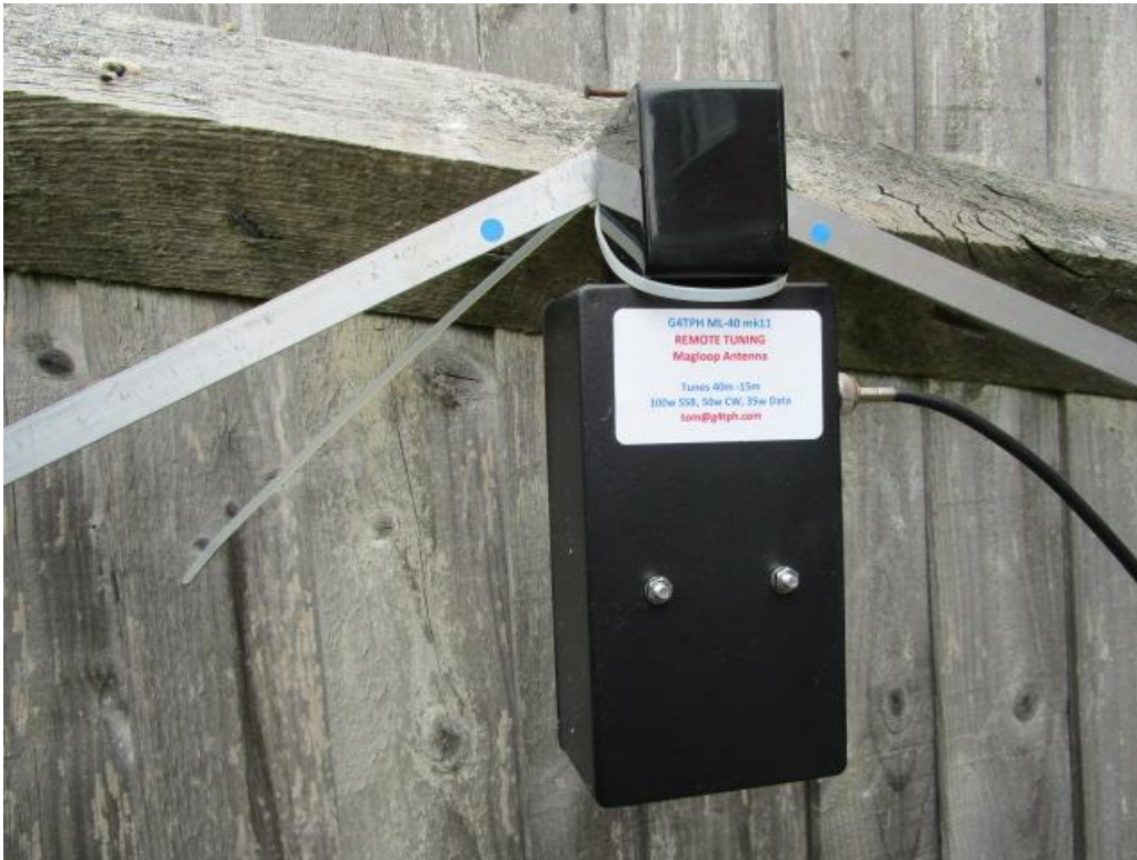
The Remote motor unit