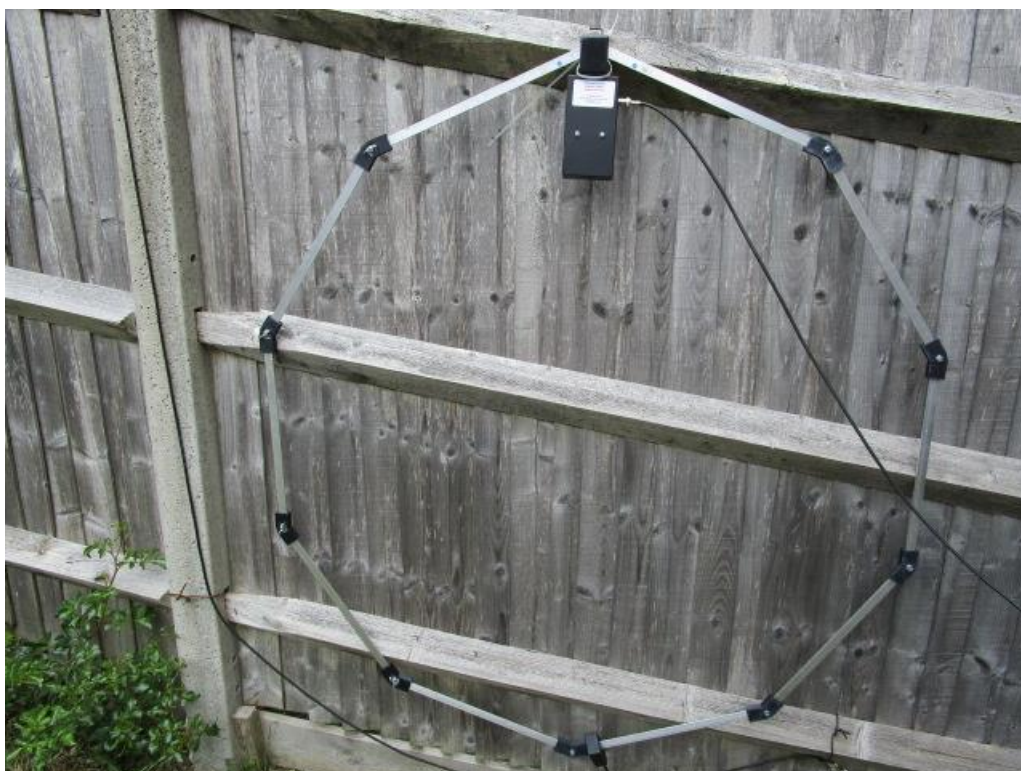
The Assembled Magloop remote tune Antenna