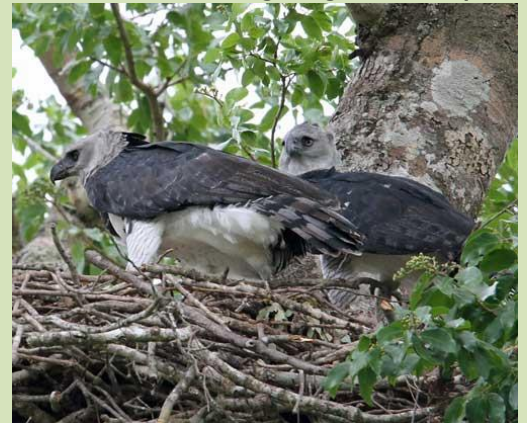
The pair of Harpy Eagles and a Jaguar