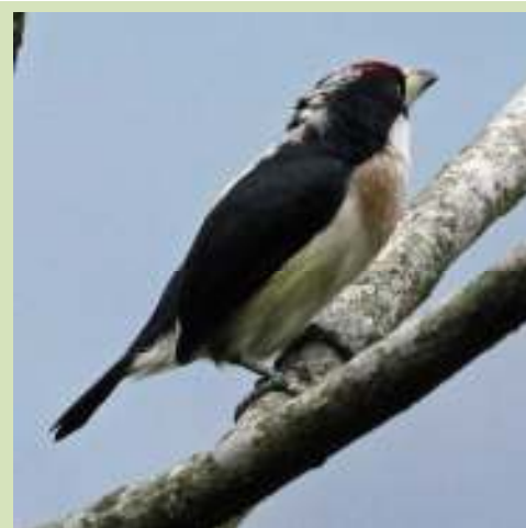
Excellent close White-mantled Barbet