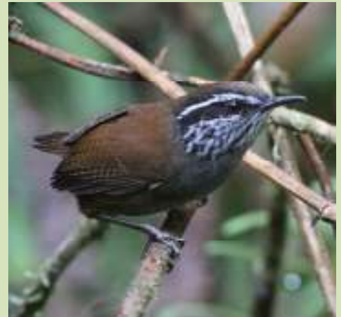
The endemic Munchique Wood-Wren performed superbly well near Las Tangaras