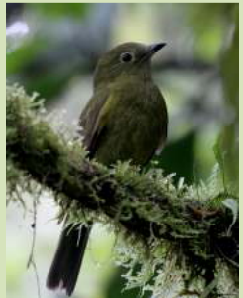
This was one of the Olivaceous Pihah that gave super views