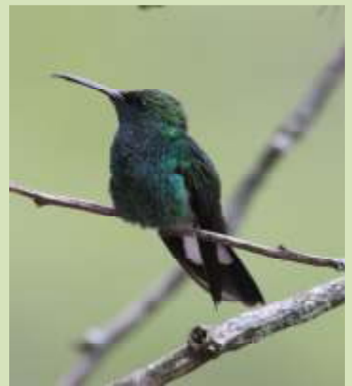
There were plenty of White-vented Plumeleteers at the feeders