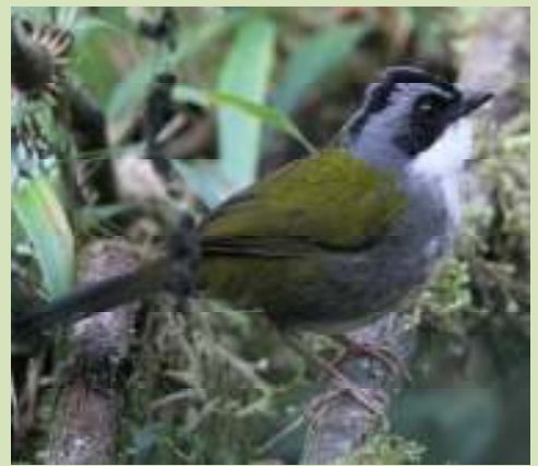
This Gray-browed Brush-Finch managed to beat the antpittas to the worms