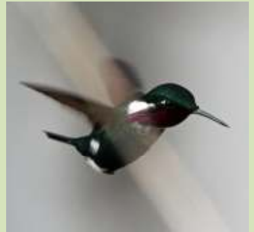
A nice male Gorgeted Woodstar was one of the highlights of the feeders