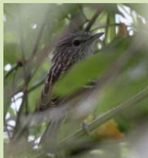
The newly split Santa Marta Antbird stayed well hidden