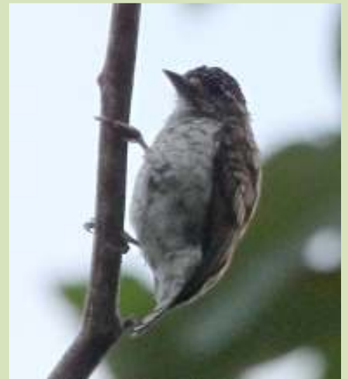
Unbelievably we saw 4 Scaled Piculets in and around the Minca area