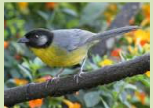
Santa Marta Brush-Finches are usually easy to see just like this one