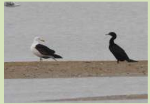
This adult Kelp Gull may well represent the first ever record for Colombia. There was also a rare American Herring Gull nearby and we previously found the first record of Forster's Tern for Colombia here several years ago! Not bad!