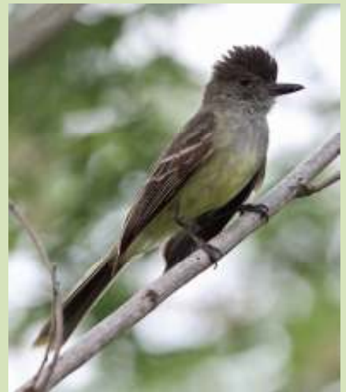
Another endemic this Apical Flycatcher showed very well