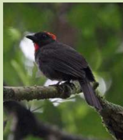
This endemic Sooty Ant-Tanager showed well