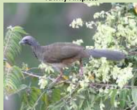
Nice Colombian Chachalaca