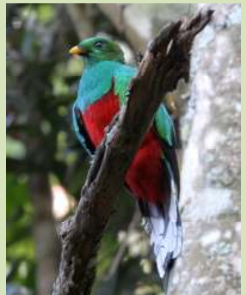
Stunning display from a pair of White-tipped Quetzals prospecting nest holes