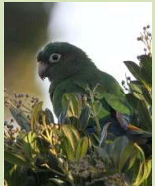
A group of Santa Marta Parakeets flew in and landed just 20ft away giving us our best views ever!

This morning we had a more leisurely breakfast before heading half way up to San Lorenzo ridge. It didn't take long before we enticed a pair of Brown-rumped Tapaculos to show off superbly in the roadside vegetation. A little further down we heard a Santa Marta Antpitta , and try as we did it just would not show. On a little further and another Antpitta called from a rocky gully, and this time nearly everyone saw it perch briefly on an open mossy branch. We continued our walk downhill and eventually came upon a pair of White-tipped Quetzals that were prospecting several different nest holes. We had absolutely fantastic views of these exquisite birds.