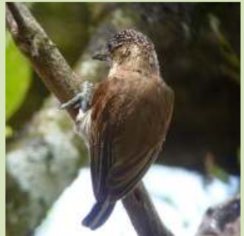
An endemic Grayish Piculet