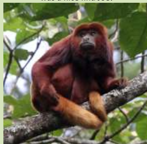
Nice Venezuelan Red Howler