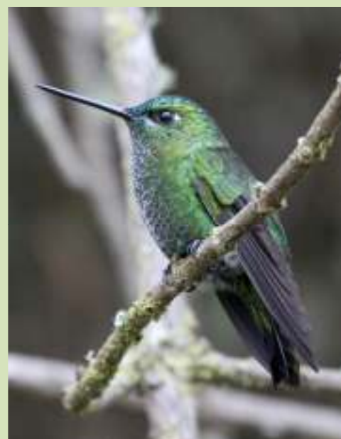
We were thrilled to get superb views of 3 Black-thighed Pufflegs at our secret stake-out!