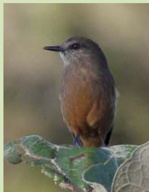
This Santa Marta Bush-Tyrant gave one of our best shows ever!