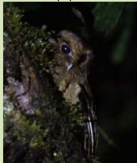
Great looks at Colombian Screech-Owl