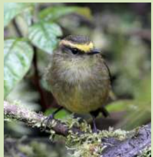
One of many Yellow-bellied Chat-Tyrants that showed well