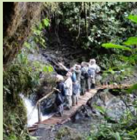
Group at Las Tangaras