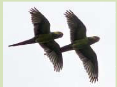
After an anxious wait we had several very rare Yellow-eared Parrots fly over our heads