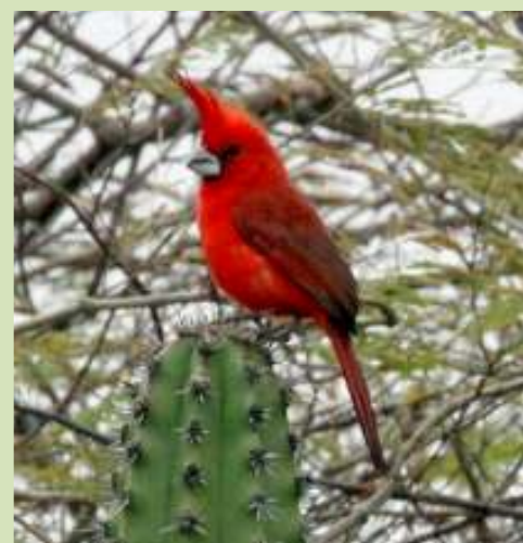
Within an hour of birding the dry scrub we had seen almost all of our target species including a superb pair of Vermilion Cardinals