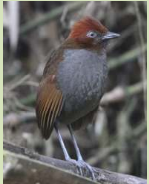
The Chestnut-naped Antpittas seem to be the dominant species at the worm station and always show well