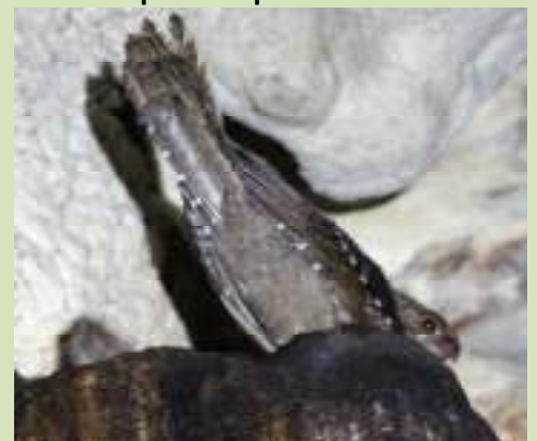
The eerie sounding Oilbirds put on a good show in their cave