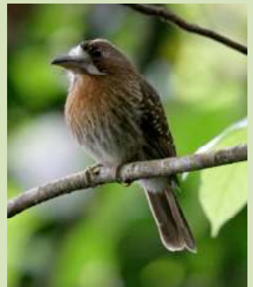
Very nice looks at this Moustached Puffbird near Minca