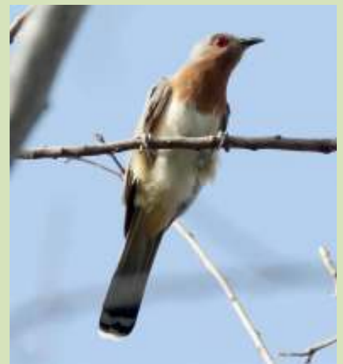
Always a nice bird to see this Dwarf Cuckoo posed on a treetop for us