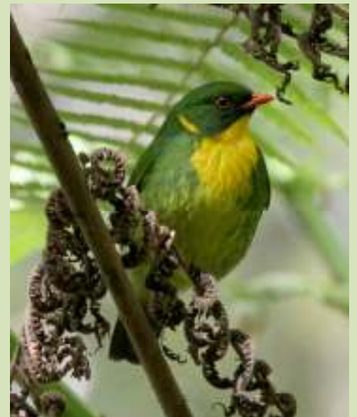
One of several Golden-breasted Fruiteaters that showed superbly