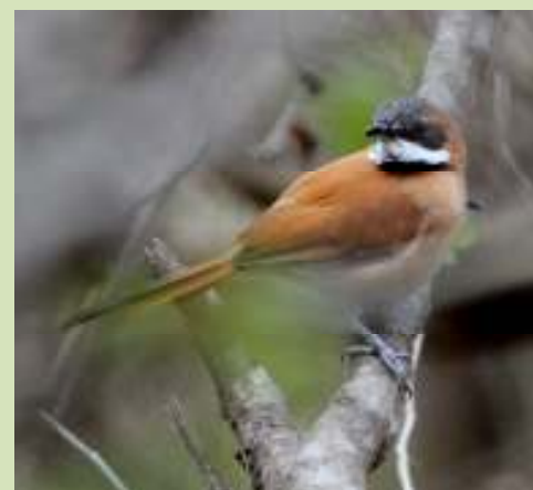
One of the White-whiskered Spinetails that eventually gave stunning views. It's probably one of the smartest looking spinetails.