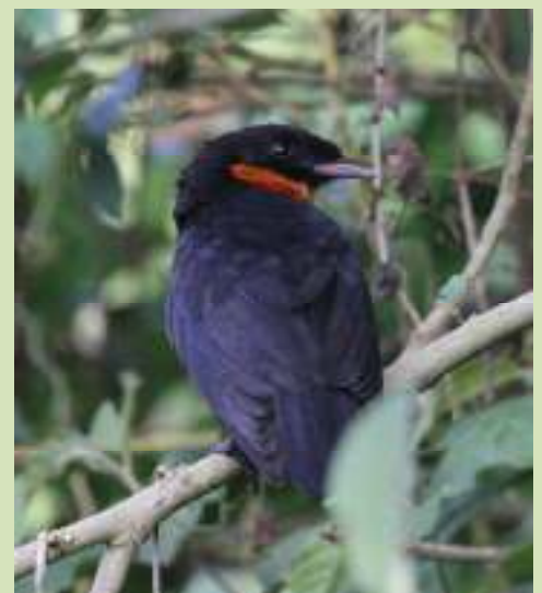
One of our target birds this Red-ruffed Fruitcrow was also easy at the lodge