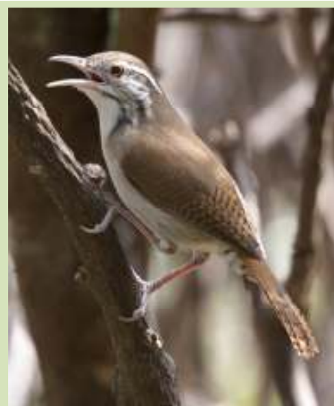
This superb Antioquia Wren performed amazingly well for us. This species was only described in 2012 and was one of many very special highlights.