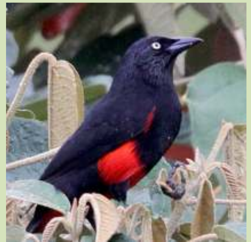
Probably one of the nicest looking grackles, this Red-bellied Grackle gave us good close looks