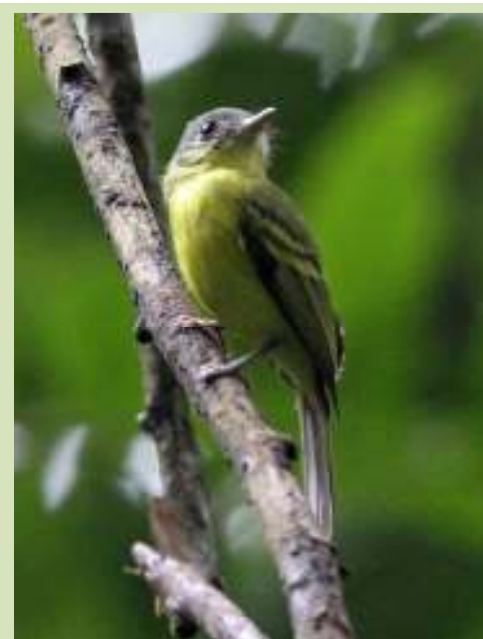
Antioquia Bristle Tyrant