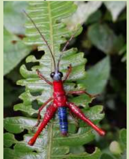
This was a very attractive endemic grasshopper we found!