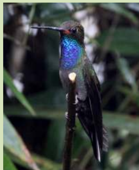
New enjoyed fabulous looks at this White-tailed Hillstar

This morning after a nice cooked breakfast we took the 4x4 jeeps up to the mountains above the lodge. The moon was visible when we departed and as the sun came up it was shaping up to be a fine day with no fog or rain. We stopped at a corner where a tree with Mistletoe held several Golden-collared Chlorophonias taking advantage of the fruit. Saffron-crowned Tanagers joined them and a few Golden-crowned Flycatchers were around as well as nice looks at Black-and-gold Tanager , Glistening-green Tanager , Golden Tanager , Purplish-mantled Tanager , Spotted Barbtail , Blue-winged Mountain-Tanager , Indigo Flowerpiercer , Tricoloured Brush-Finch and Red-headed Barbet . A Buffy Tuftedcheek flew across the road and was later seen well as it worked up a trunk. Several of us moved over to see the stunning view of the mountains and various layers of cloud as some Black-chinned Mountain-Tanagers landed in a tree about our viewpoint. Nearby a few Sharpe's Wrens were seen as well as a Tropical Parula and Yellow-throated Brush-Finch . We moved into the forest along a trail where we had good views of Black Solitaire and Montane Woodcreeper . It was very quiet for a long time and we