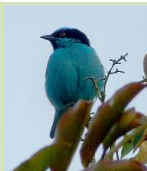
Our best views ever of the endemic Turquoise Dacnis! Wow!