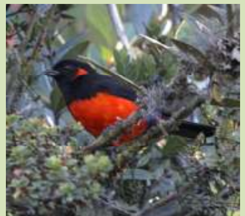
Scarlet-bellied Mountain-Tanager always liven up the hillsides with their dazzling plumage