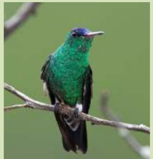
The endemic Indigo-capped Hummingbird was one of the commonest birds at the hummingbird garden