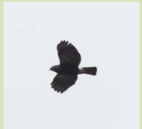
We had some great looks at White-rumped Hawks today.

Steve and Diego were out way before dawn to try and locate a Colombian Screech-Owl and found two birds calling on one of the forest trails. Steve quickly returned to get everyone and even though one bird was heard very close and seen briefly flying over, that was the best we could do with this uncooperative bird. As the sun rose, we came out of the forest and birded the grounds of the lodge starting with some very close Cauca Guans , Crimson-backed and Summer Tanagers and two Pale-vented Pigeons perched on a distant dead tree. We moved around to the other side of the lodge and found two Gray-necked Wood Rails out on the