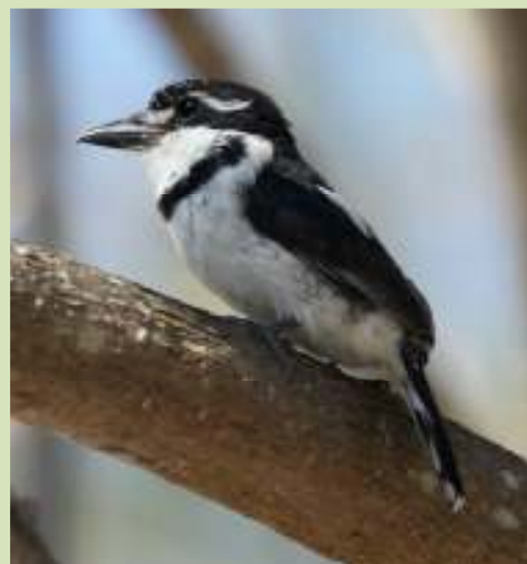
A very showy pair of Pied Puffbirds were a delight at Isle de Salamanca

This morning everyone was up early and eager to get going. We drove to Isle de Salamanca National Park and on arrival were taken by one of the local guides to a perched Sapphire-bellied Hummingbird ! How easy was that! We enjoyed reasonable views before it flew off but a short while later we had prolonged excellent views of this extremely rare hummer. While watching this we also found a Limpkin, Green Heron , a couple of Purple Gallinules , two showy Yellow-chinned Spinetails and a huge Ringed Kingfisher . We then had a picnic breakfast while enjoying the most amazing close views of a pair of Pied Puffbirds . Close by a Russet-throated Puffbird performed well and Prothonotary Warblers were everywhere. As we made our way into the mangrove we got great looks at Northern Scrub Flycatcher , and a pair of Bicolored Conebills . Several Spotted Sandpipers were seen as well as confiding Solitary Sandpipers and Lesser Yellowlegs . An Osprey then flew over while we managed views of Black-necked Stilt, Whimbrel and Willet . Along the boardwalk a Striated Heron flew off, Northern Waterthrush flitted around, Straight-billed