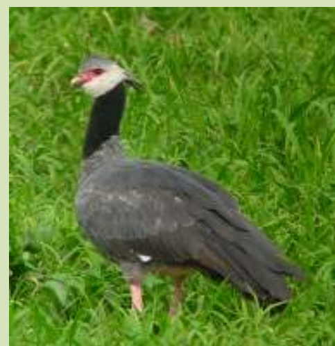
We had great looks at 4 Northern Screamers together