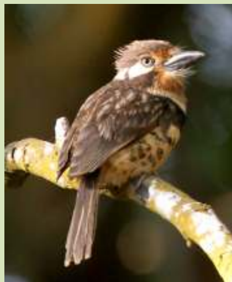
Russet-throated Puffbirds not only look good they also sit still