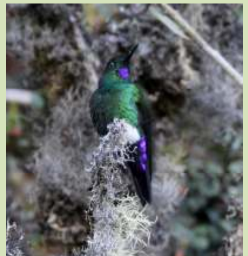
Glowing Pufflegs certainly lived up to their name when seen in good light