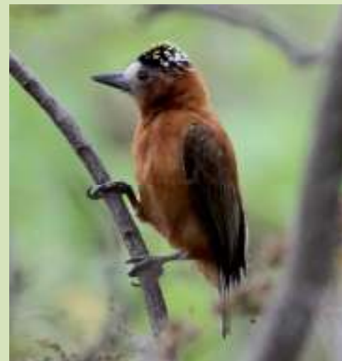
This Chestnut Piculet was a star bird and gave some of our best views ever!