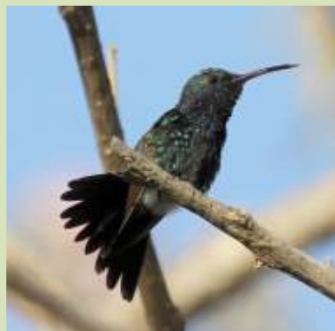
This rare Sapphire-bellied Hummingbird showed well for us