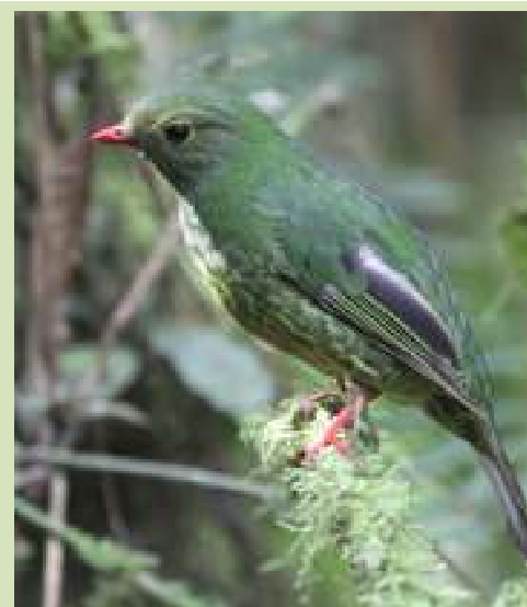
This Green-and-black Fruiteater came in so close some people couldn't focus their cameras on it

This morning we were up early and heading to Los Nevados National Park and the high paramo with its avian specialties. It was rather chilly to start off with in the morning but shaped up to be another nice dry day as we worked our way up into the park. As we were finishing our field breakfast a Golden-breasted Puffleg landed on top of a close bush and a Pale-naped Brush-Finch was