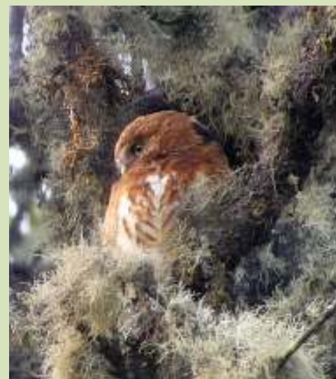
Nice looks at this Andean Pygmy-Owl that came in and looked us over - Gina