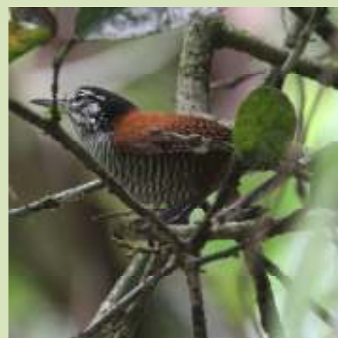
A pair of Bay Wrens chased each other around allowing good views