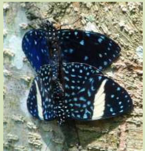
Cracker Butterflies were seen many places