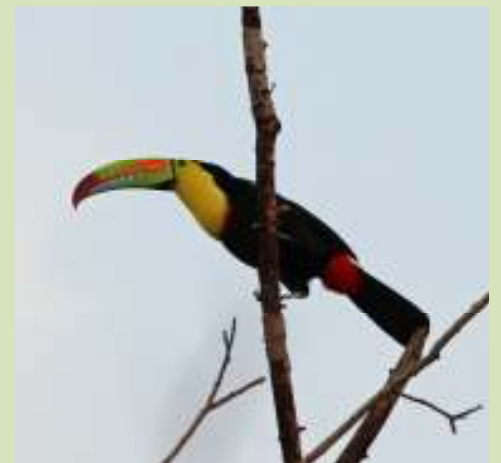
A pair of displaying Keel-billed Toucans ended a great day