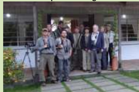
Group at one of the hummingbird feeders