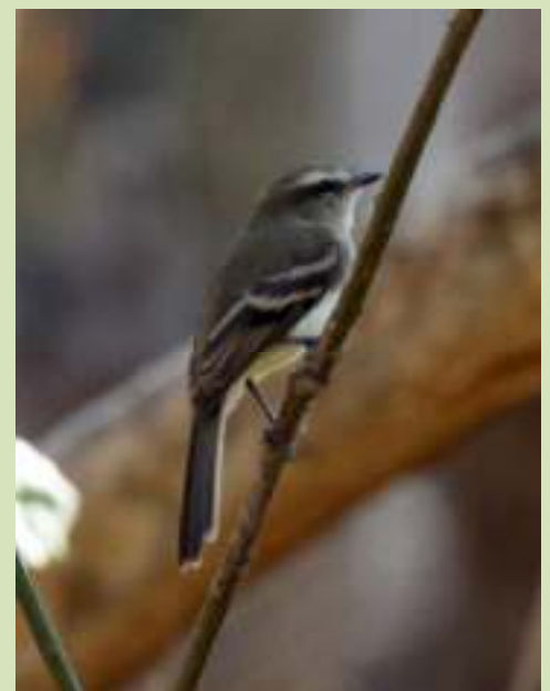
Another rare sighting this Fuscous Flycatcher may have never been recorded in this area before