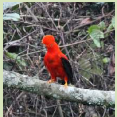
Andean Cock-of-the Rocks put on a great show!