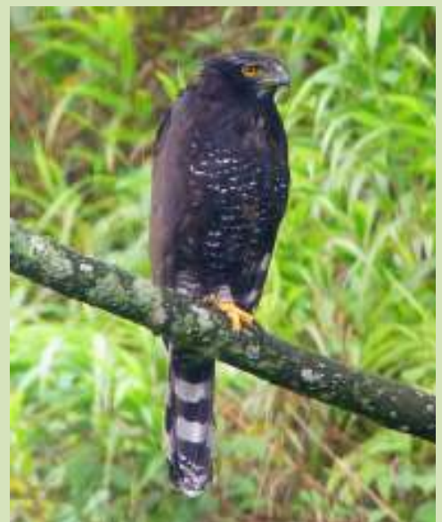
Unbelievably views of a perched Black Hawk-Eagle by Gina