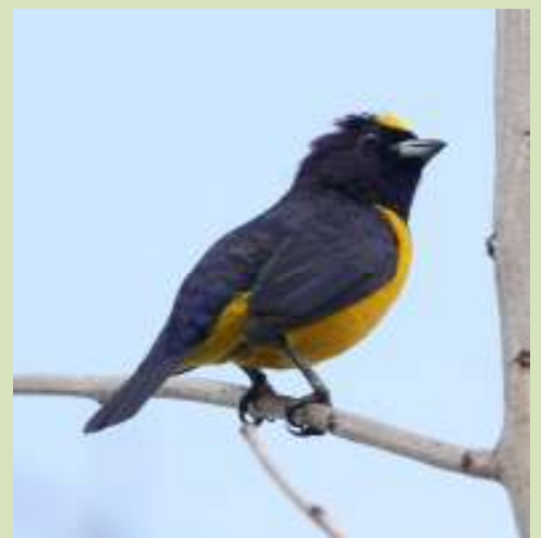
Our best views ever of the endemic Velvet-fronted Euphonia