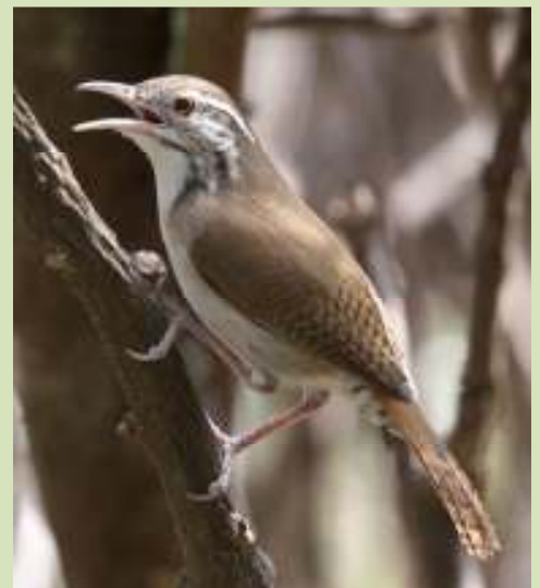
The newly discovered Antioquia Wren a new species to science gave stunning views

We left Medellin early this morning and drove to the eastern slope of the central Andes to our breakfast spot overlooking a valley filled with flowering Inga trees. Little did we know that this amazing day would see us find 122 species and would be one of the best birding days of the trip. Breakfast was served as we watched Gray Seedeaters , Thick-billed Euphonia , Palm Tanager , Blue-gray Tanager , Lemon-rumped Tanager , Plain-coloured Tanager , Black-throated Mango , Streaked Flycatcher , and Blue-necked Tanagers from the verandah. Derek spotted a troupe of White-footed Tamarins moving through some trees down the hill and we all managed good views of them. On the flowering trees two Green Thorntails were enjoyed and Rusty-margined Flycatcher was seen. After breakfast, we walked from the restaurant to a small dirt road that led down into the valley. A couple of Black-headed Brush-Finches caught our attention along the main road and soon we were descending the quieter road which was filled with birds. Starting with Rufous-tailed Hummingbird ,