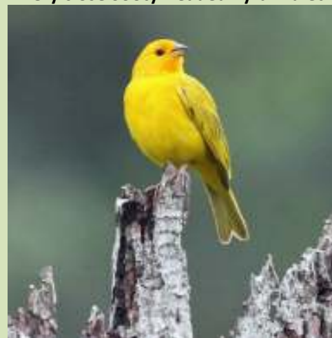
Saffron Finches seen at many places