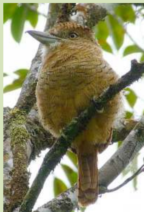
A Barred Puffbird was seen well