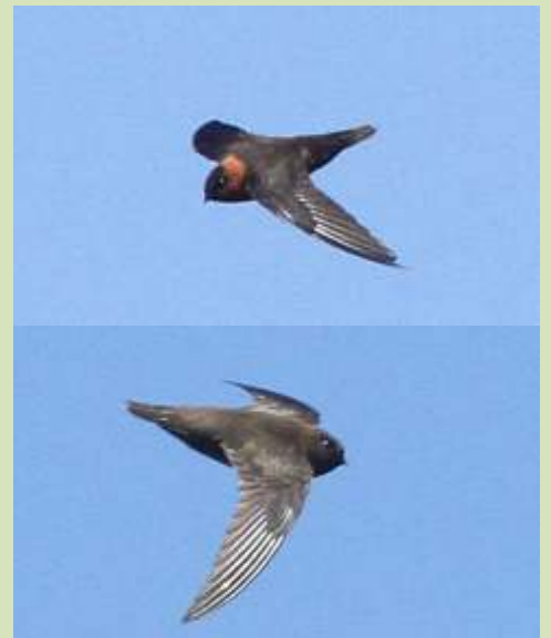
Nice views of adult and immature Chestnut-collared Swifts