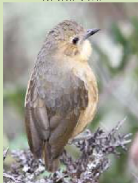
With had superb close views of this Tawny Antpitta