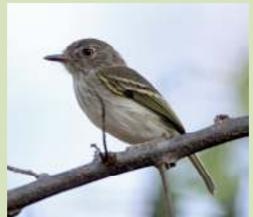
Pearly-vented Tody-Tyrants were plentiful amongst the dry scrub