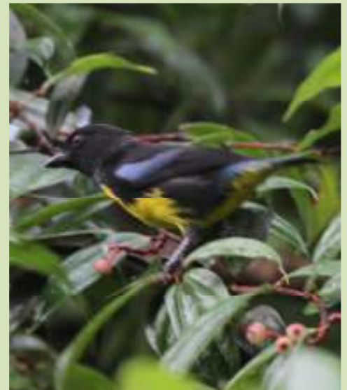
Another endemic this Black-and-gold Tanager was easy at Las Tangaras