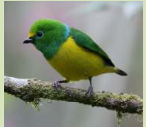
Blue-naped Chlorophonias came to feed on Bananas at the little shop