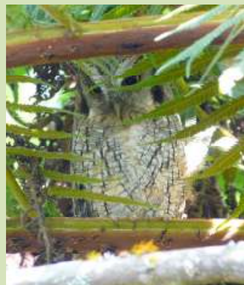
Nice find this Tropical Screech-Owl posed for us on a day roost