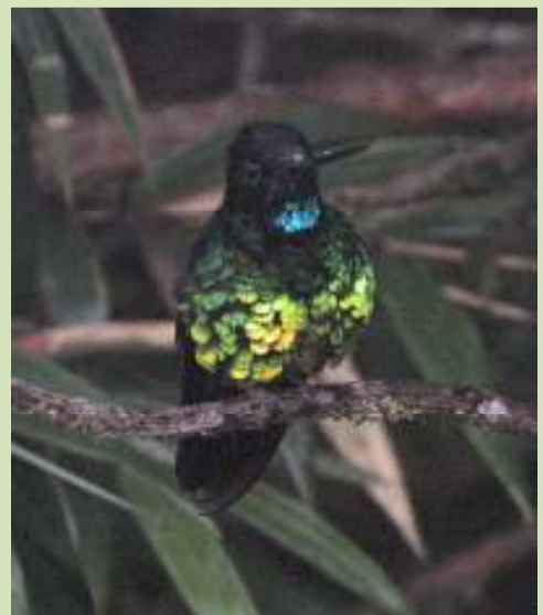
Not such a good picture as it was raining but we had fantastic views of two rare Dusky Starfrontlets . Our 3 rd year finding this species at this locality