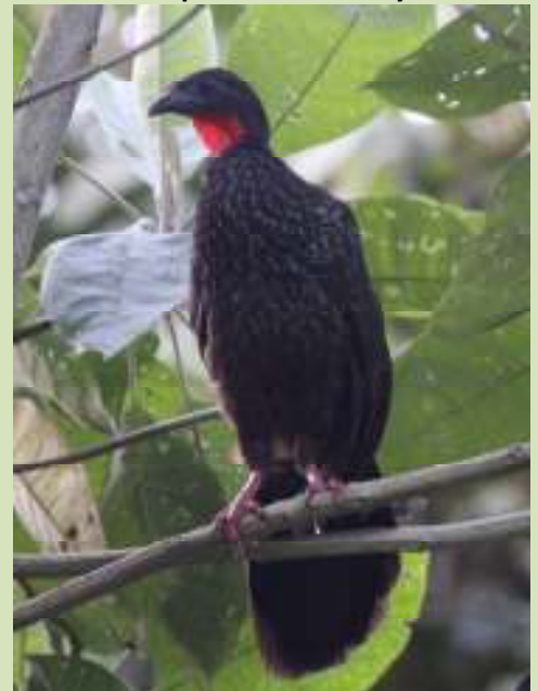
Another endemic this Cauca Guan was easy to see around the lodge grounds