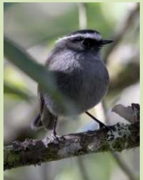
This Crowned Chat-Tyrant was another that gave the best views ever!