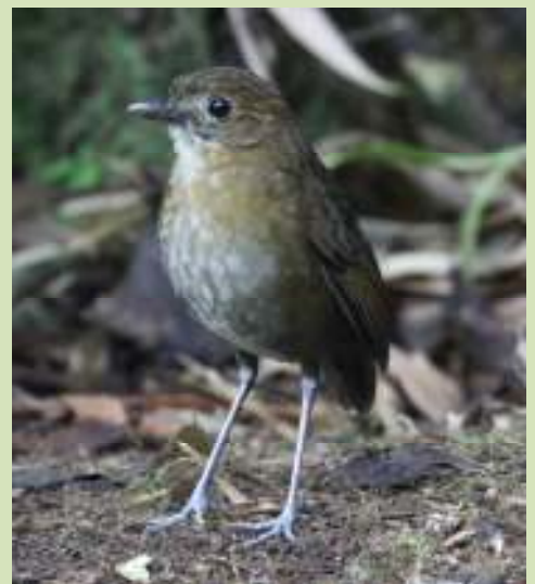
The endemic Brown-banded Antpitta did not disappoint us!