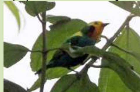
Multicoloured Tanager's showed well