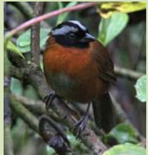
Always sought after we had excellent views of a pair of Tanager Finches