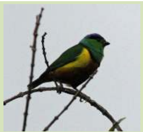
We enjoyed some of our best views ever of a pair of Chestnut-breasted Chlorophonias that fed on a bush beside the road