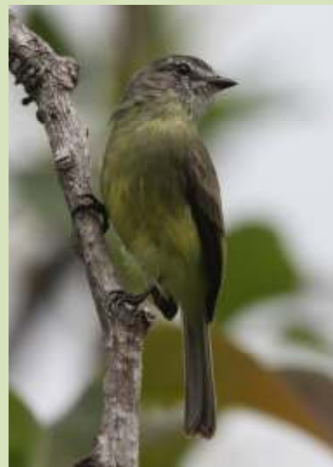
Very close Sooty-headed Tyrannulet