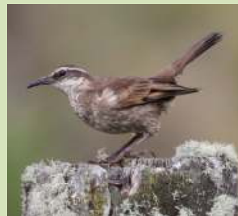
This Stout-billed Cinclodes performed well at Los Nevados NP