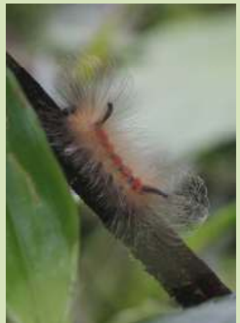
It's not just birds that are very interesting! How about this strange caterpillar