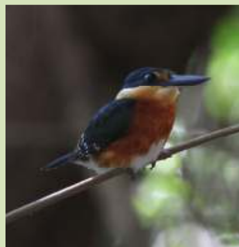
A very close American Pygmy Kingfisher at Isle de Salamanca

Today we set off very early in our 4x4's so as to arrive at the top of San Lorenzo Ridge by dawn. As the sun came up over the mountains we were treated to a spectacular sunrise. The first of many Santa Marta Brush-Finches started a superb day of birding. Scarlet-fronted Parakeets flew in making a lot of noise while Band-tailed Guan could be heard and then our first Yellow-crowned Whitestart showed well. We then found Santa Marta Mountain-Tanager and got super views of a Santa Marta Bush-Tyrant . A couple of hummingbirds fed on nearby flowers and included Tyrian Metaltail , and Mountain Velvetbreast . We were then in for a real treat as a flock of Santa Marta Parakeets flew in and landed fairly close by allowing good scope views. They then took off and flew right over us and landed about 20ft away in a