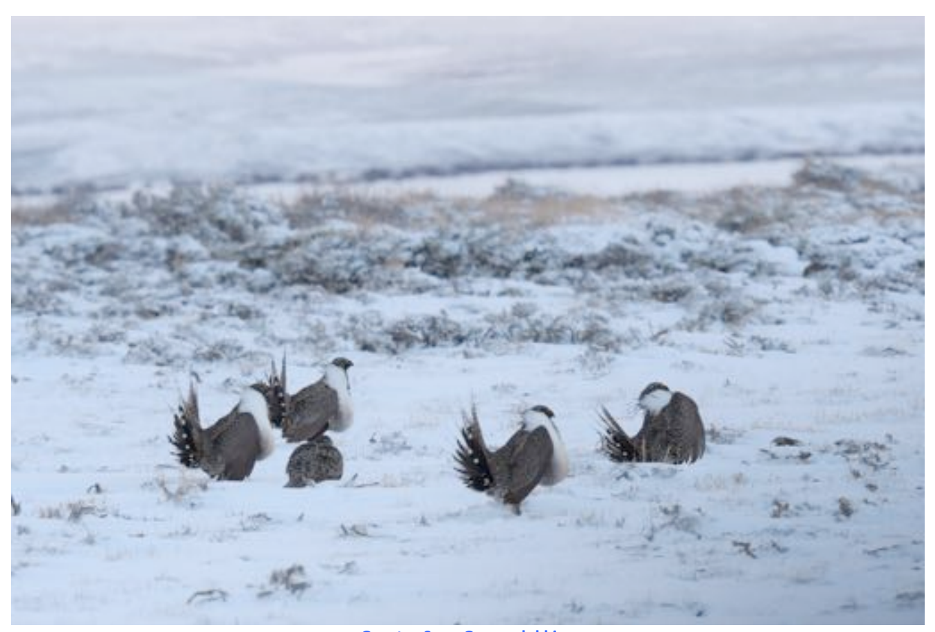
Greater Sage Grouse lekking