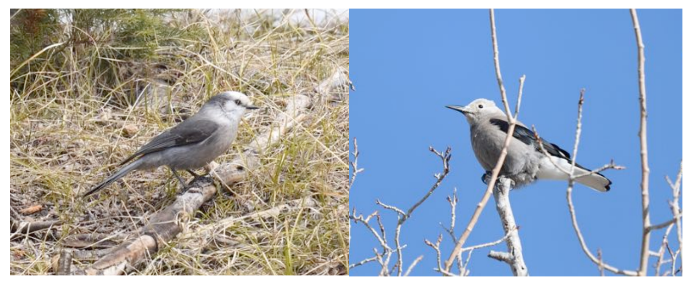
Grey Jay Clarke's Nutcracker

We visited some nearby feeders in a residential area after a leisurely 7am breakfast and this proved to be a great visit as there were at least 2 male Pine Grosbeaks and at least one female present in the surrounding trees. One male was particularly obliging as he came down to a roadside puddle to drink right in front of us. A few Red Crossbils were also particularly pleasing to some of our group as they were of the 'ponderosa pine' race. At least 12 Brown-capped Rosy-Finches were here, along with a couple of Grey-crowned Rosy-Finches ,