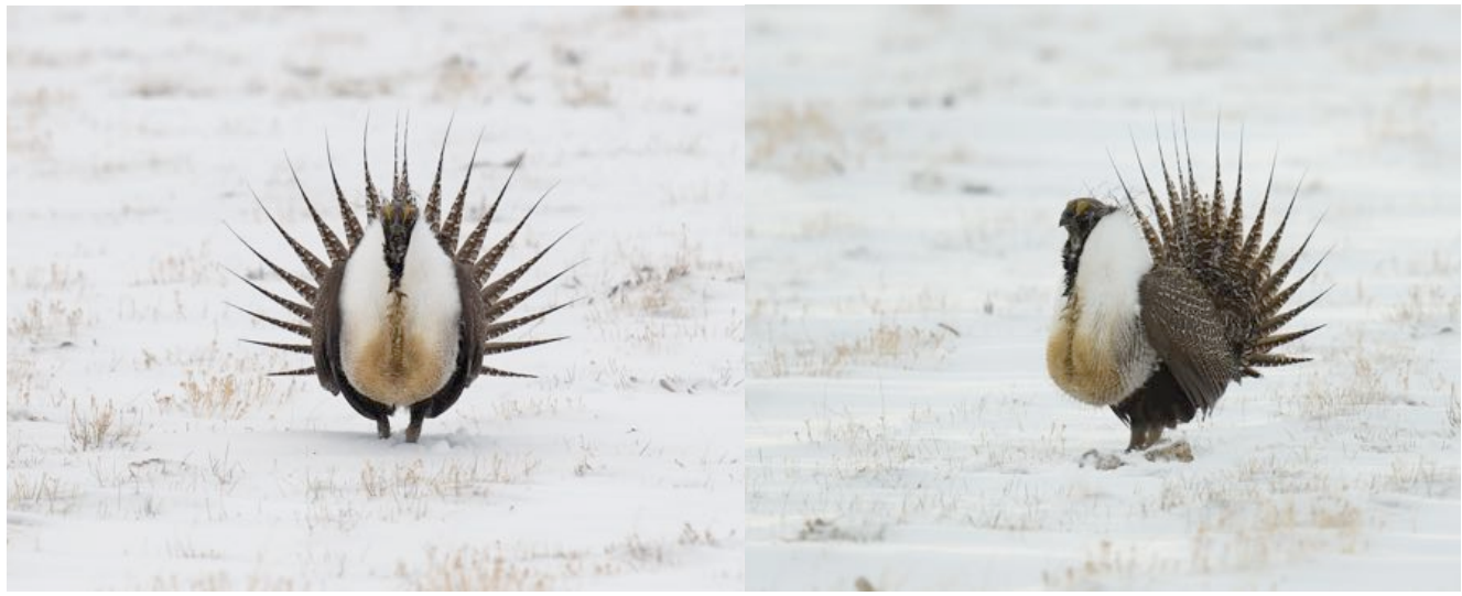
Greater Sage Grouse

Another day, another chicken lek and this time we drove along icy, snow-covered roads to a high plateau with snow-capped mountains all around to view Greater Sage Grouse . The birds were already present when we arrived just before daylight and we were treated to an amazing display from these gorgeous birds as the males inflated their air sacs, threw their heads back and called. We were here for maybe 90 minutes and there were maybe 30 birds opposite us and quite close, as well as another mini-lek further along the road with up to 6 birds. What a privilege to see these birds doing their thing.... And add to this some stunning scenery all around covered in a fresh dusting of snow made it a really special experience.