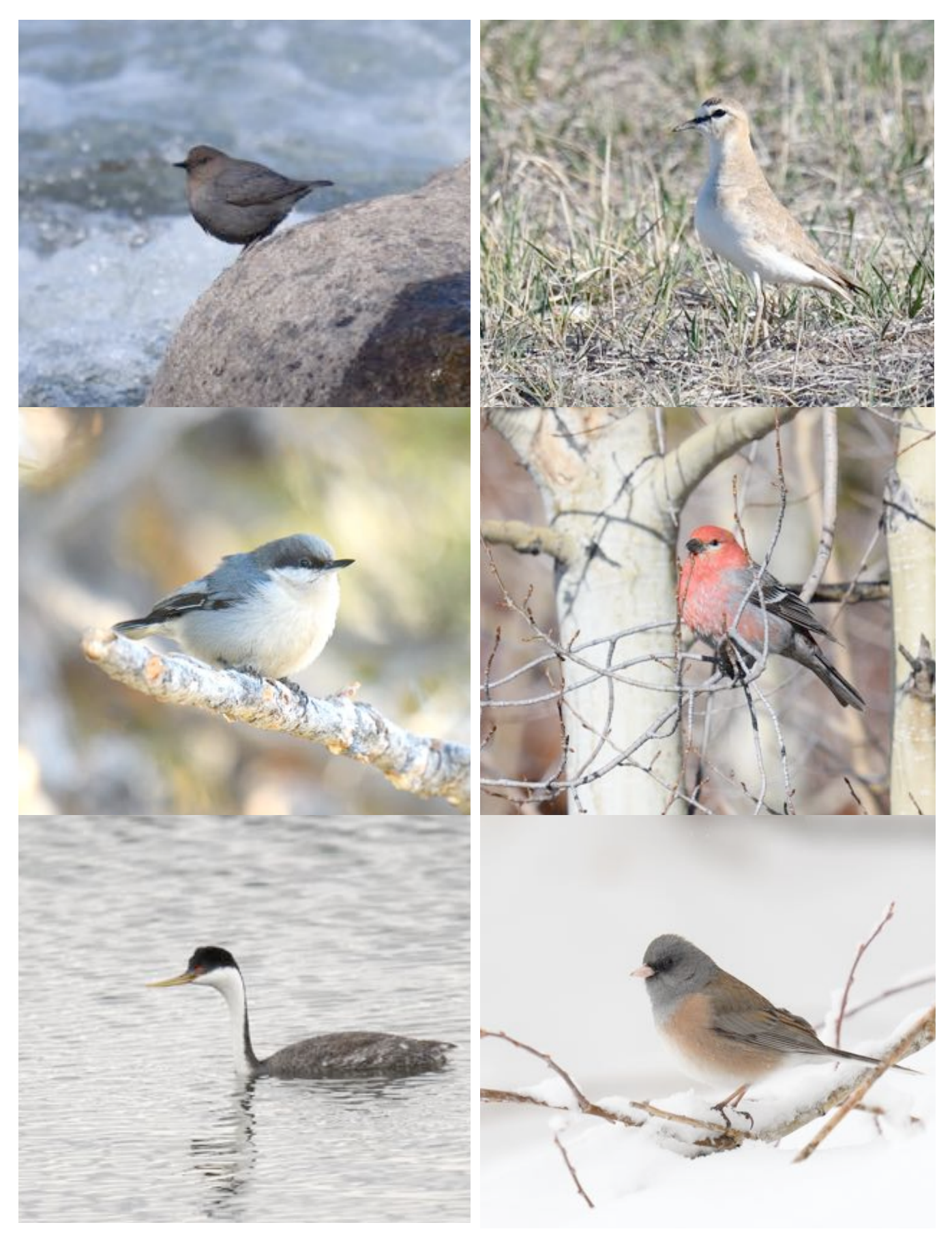
Photos clockwise: Mountain Plover (top right), Pine Grosbeak, Pink-sided Junco, Western Grebe, Pygmy Nuthatch & American Dipper.