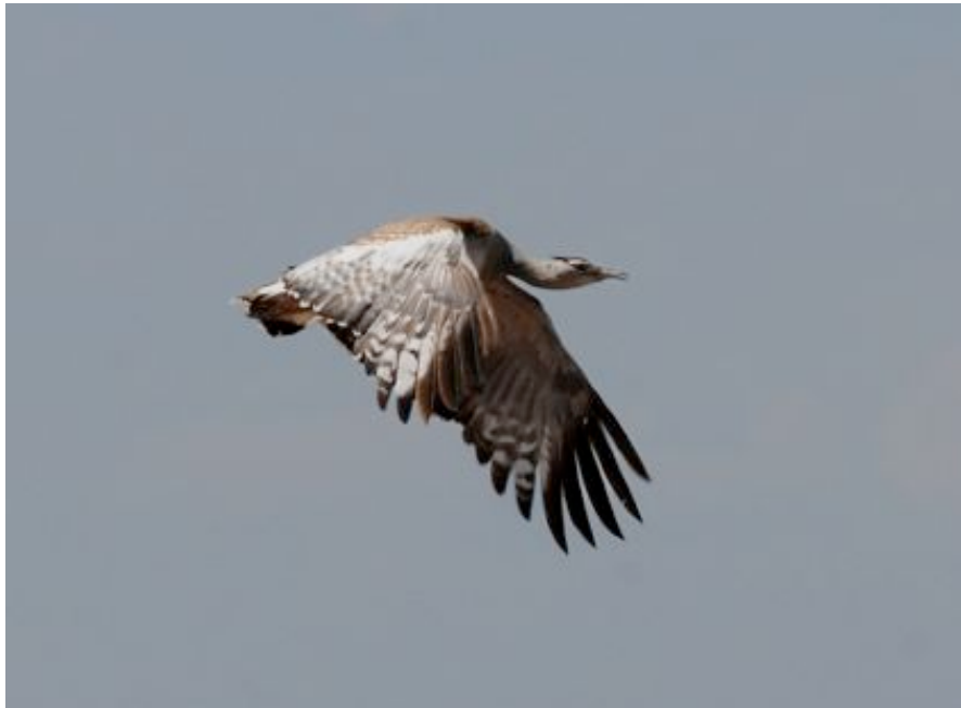
Arabian Bustard - Awash National Park

banded Plovers . Nearby we had a couple pairs of Yellow-breasted Barbets showing well, an incredible bird and one I wasn't expecting for some reason. Overhead we had lots of Montagu's and a few Pallid Harriers , Brown Snake-Eagle and flocks of Chestnut-bellied Sandgrouse . Leaving here we drove to the Aladeghe Plain and I think we left it a bit too late