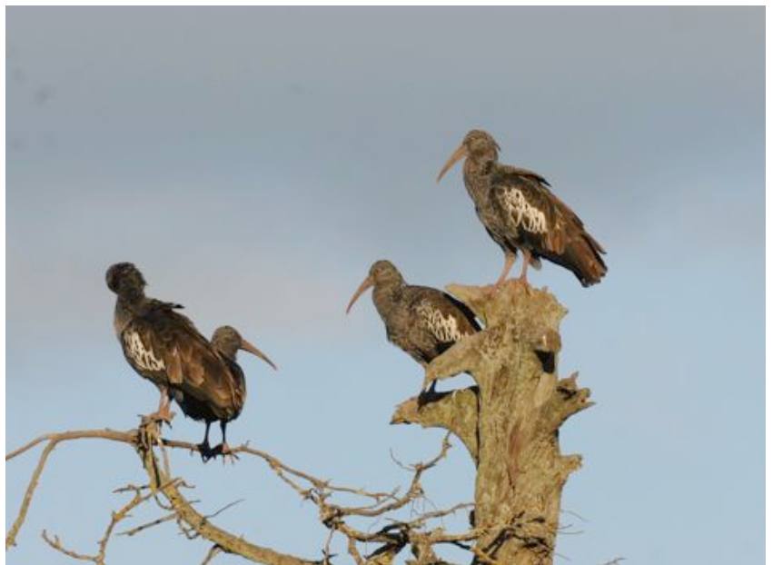
Wattled Ibis - Bale Mountains

drove to the Agricultural College and spent a pleasant couple of hours walking through the forest seeing our first Abyssinian Orioles , which were surprisingly common here. Flocks of Mountain Thrushes were present, along with even more Lemon Doves , a flyby Tambourine Dove , a few Red-headed Weavers and eventually a fine Narina Trogon . A quick walk through more open areas gave us Double-toothed Barbet , Yellow-fronted Tinkerbird , Grey-backed Fiscal and noisy gangs of White-rumped Babblers .