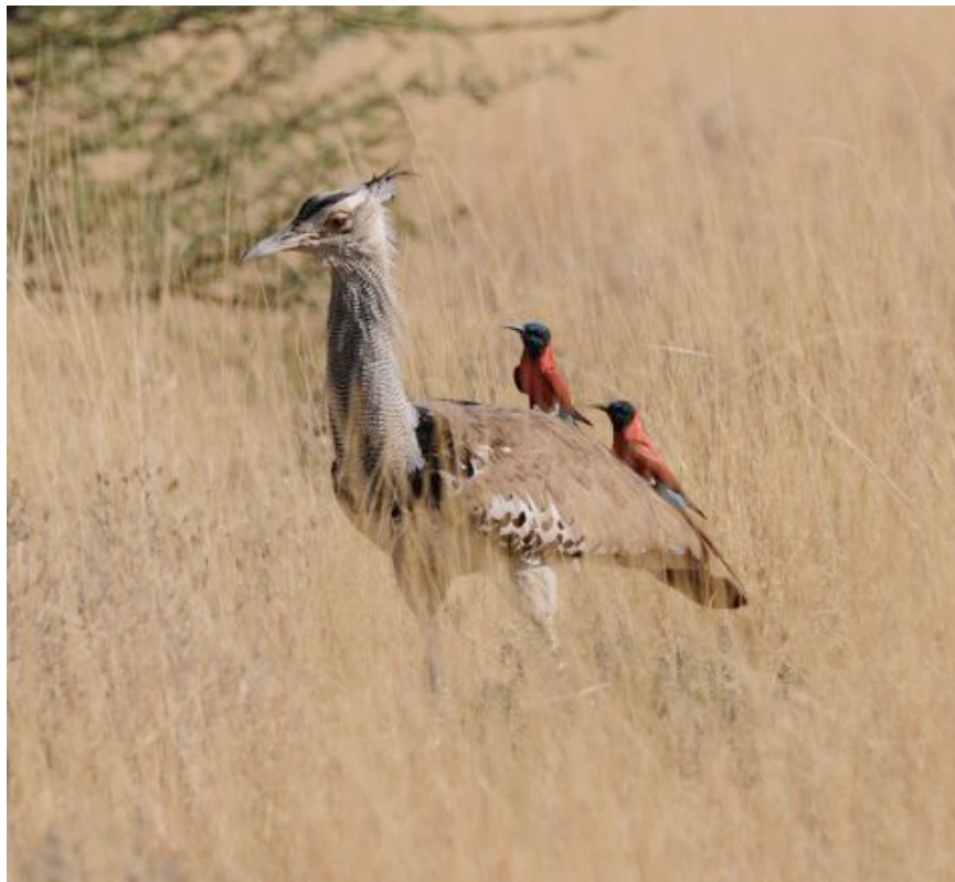
Kori Bustard and Northern Carmine Bee-eaters