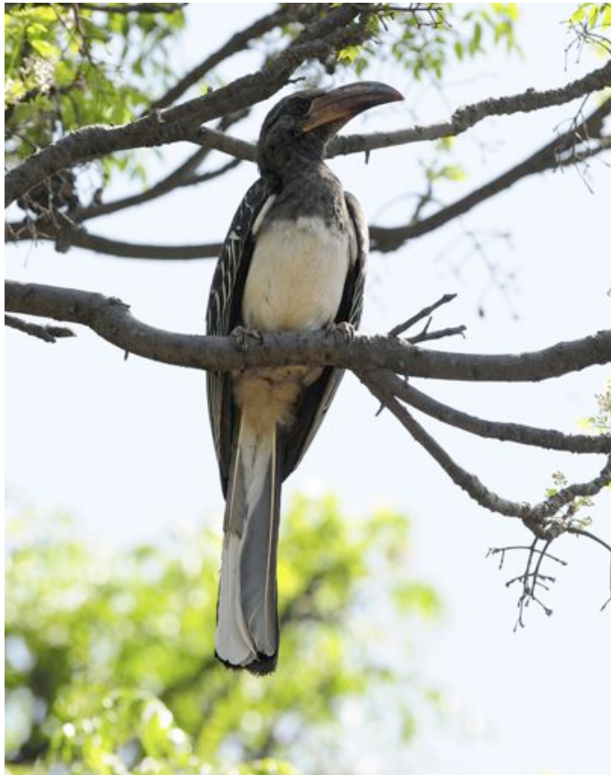
Hemprich's Hornbill at Lake Ziway

On the road by 5.30am and drove in darkness back towards Addis Ababa and then got through the city without too many hold-ups. Our crazy schedule meant we got down to a cracking hotel overlooking Debre Zeit Crater for breakfast and from the veranda we could overlook a scrub and acacia covered slope down to the lake which was very scenic. There were lots of birds moving around in the morning sunshine and one of the first was possibly the best one of the day, in the shape of several Blue-breasted Bee-eaters perched up nearby. I was surprised to see this Erckel's Francolin perched below us, whilst species such as Abyssinian White-eye , African Paradise-Flycatcher and African Dusky Flycatcher were more expected. More familiar wintering birds such as Common Whitethroat , Willow Warbler and Blackcap were also a welcome sight. Overhead, African Fish Eagle , Marabou Stork , Pink-backed Pelican , Booted Eagle and Osprey were noted. And a fine breakfast was also much appreciated!