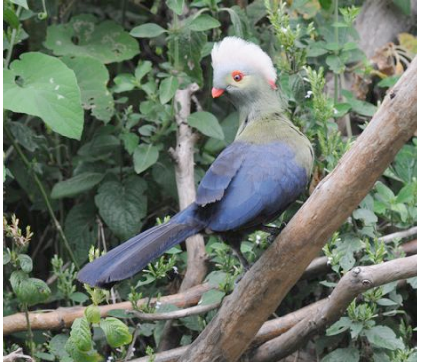
Prince Ruspoli's Turaco

It was hard to drag ourselves away from here but our ultimate goal of the day was to find Prince Ruspoli's Turaco and at the first site we tried a pair were found quite quickly, along with a Levaillant's Cuckoo . But at the second site we had mind-blowing views of this bird feeding along a hedge just below our vantage point. It was incredible to be able to watch this stunning endemic for at least five minutes and just soak up the views. There were also several Bruce's Green-pigeons feeding in a large fig tree here, along with a pair of Double-toothed Barbets , whilst a Northern Black Flycatcher certainly wasn't 'bird of the day'. From here we still had an hours drive to get to Negelle and finally arrived around 7pm at a very nice hotel indeed.