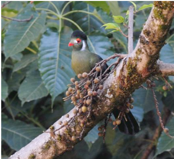
White-cheeked Turaco at Debre Libanos

Overhead there was a constant stream of Yellow-billed Kites , Hooded Vultures , a few Ruppell's and White-backed Vultures , plus the first of 5 Lammergeiers to be seen today. Just as we were about to get back into the landcruiser, a Moorland Chat flew up onto the telegraph wire right next to us. Once out on the plain and we made our first stop when a little group of endemic Wattled Ibis were spotted beside a small pool. After a nice look at them through the scope we also saw a couple commoner endemics with White-collared Pigeon and Blue-winged Goose showing well, plus Egyptian Goose , Tawny Eagle , Plain Martin and flocks of Yellow Wagtails as well. Our next stop produced yet another endemic, this time