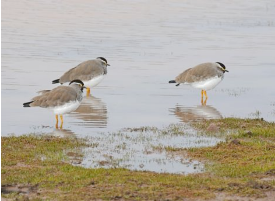
Spot-breasted Plovers - Bale Mountains

What a cracking day this was and lived up to all expectations as we visited the Sanetti Plateau. Leaving at 6.30am after a long night's sleep we stopped just out of town as the roadside was crawling with birds, most of which turned out to be Streaky Seedeaters , but a Ruppell's Robin-chat was also very nice and a bunch of Chestnut-naped Francolins also