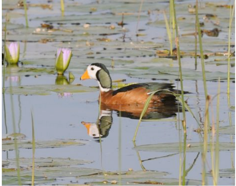
African Pygmy-Goose at Lake Hawassa

Up and out before sunrise, listening to the sounds of the well wooded gardens coming to life. We pretty quickly caught up with Silvery-cheeked Hornbill whilst walking down to Lake Hawassa and spent a pleasant time scanning the area where our first White-backed Duck was found. Several African Pygmy Goose were close by, and as we watched them a few White-rumped Babblers worked their way towards us, a Lesser Swamp Warbler and Black Crake appeared close by. Just at the edge of the gardens a flowering tree was attracting numerous sunbirds with Tacazze, Scarlet-chested, Beautiful and Shining Sunbirds giving outrageous views. An African Thrush then appeared and was followed by Northern Grosbeak-Weaver , lots of Little Weavers , a single Spectacled Weaver and a Rufous-throated Wryneck . It was pretty full on as there were so many birds appearing all at once – lovely!