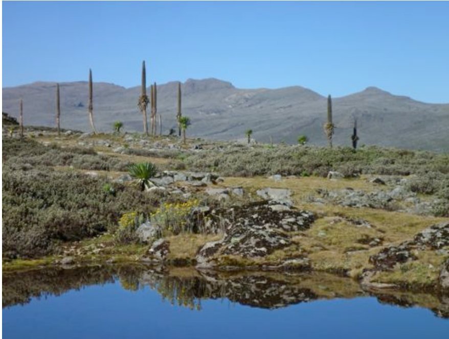
The Sanetti Plateau

Today we birded the highest road in Africa, under the second highest mountain in Africa and found the rarest 'canid' in the world – Ethiopian Wolf . The scenery was stunning amidst fine Afro-alpine moorland habitat with giant lobelias dotted across the moorland plateau. We made a short walk at the treeline and quickly nailed the local race of Brown Parisoma before setting off across the plateau where we found our first Spot-breasted Lapwings . There was also Chestnut-naped Francolin , a small group of Moorland Francolins , Ruddy Shelduck ,