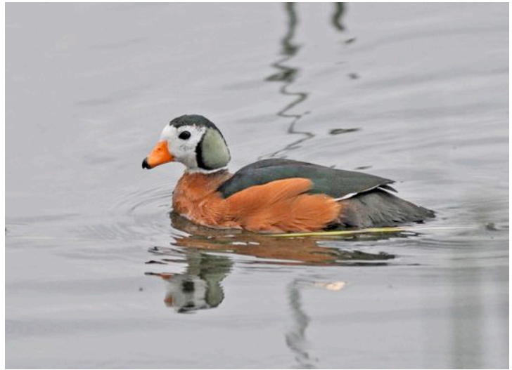
African Pygmy Goose

Walking out the gate to view the lake 3 African Pygmy Geese (and what stunners they are!) and our first Grey-headed Gulls were present. Following the path bordering the lake many more new birds appeared such as a Nubian Woodpecker , Blue-headed Coucal , Marsh and Sedge Warblers , Scarlet-chested Sunbird , White-rumped Babbler , Common Waxbill and after much scrutiny a Lesser Swamp Warbler . And we had really close views of plenty of other species such as White-winged and Whiskered Terns , Black-winged Lovebird , a flock of really confiding African Citrils , Eastern Olivaceous Warbler , Common Whitethroat , Sand Martin and more.