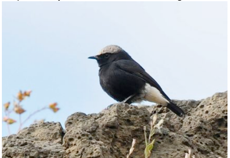
The endemic Abyssinian Wheatear

We left at 4am for a full day in the Jemma Valley, which produced a superb number of great species that began with an awesome Harwood's Francolin calling about 30m metres away on the slope below the road. As we watched this a Long-billed Pipit appeared behind us, plenty of Cinnamon-breasted Buntings appeared and then a short while later we picked up an Erckel's Francolin calling from on top of a boulder below us. We also enjoyed views of a pair of Abyssinian Wheatears here but got much better views further down the road. As the cool of the morning gave way to soaring temperatures we drove down into the valley we saw Dark Chanting Goshawk , Booted Eagle , Verreaux's Eagle , Eastern Grey Woodpecker , Blue-breasted Bee-eater , Red-throated Wryneck , Red-collared Widowbird , African Citril , and best of all a couple of endemic Yellow-rumped Seedeaters . Further down we really enjoyed some fine breeding-plumaged Black-winged Red Bishops , Little Bee-eater , African Silverbill , Bush Petronia , and also saw Namaqua Dove , our only Vinaceous Dove of the trip, Speckle-fronted Weaver , and both Isabelline and Woodchat Shrikes .