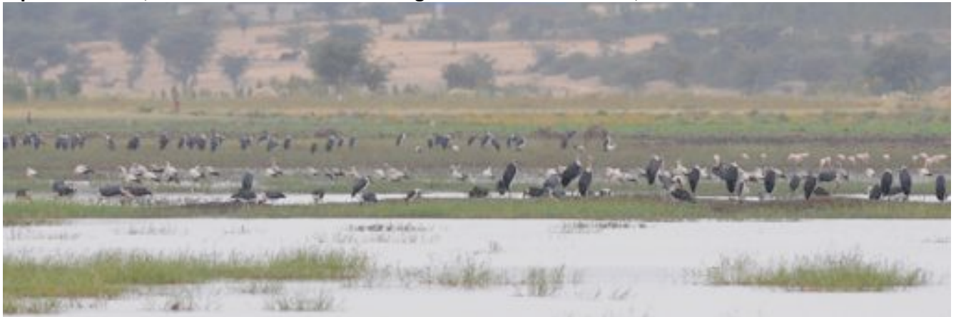
There was a mass of birds at the Cheleklaka Wetlands

After a leisurely 6am breakfast we headed out of Addis Ababa and down into the Great African Rift Valley and the first of a series of bird-filled lakes. At the Cheleklaka Wetlands there were simply birds everywhere, and in big numbers. New birds here were Red-billed Teal , Common Crane , Glossy Ibis , Squacco Heron , 100's of White Storks amongst the Marabou Storks , 100's of Greater and Lesser