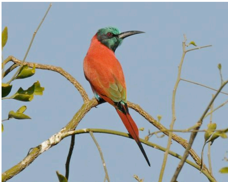
Northern Carmine Bee-eater

So we finished by 11.30am and walked back to the open restaurant and had a nice lunch, before