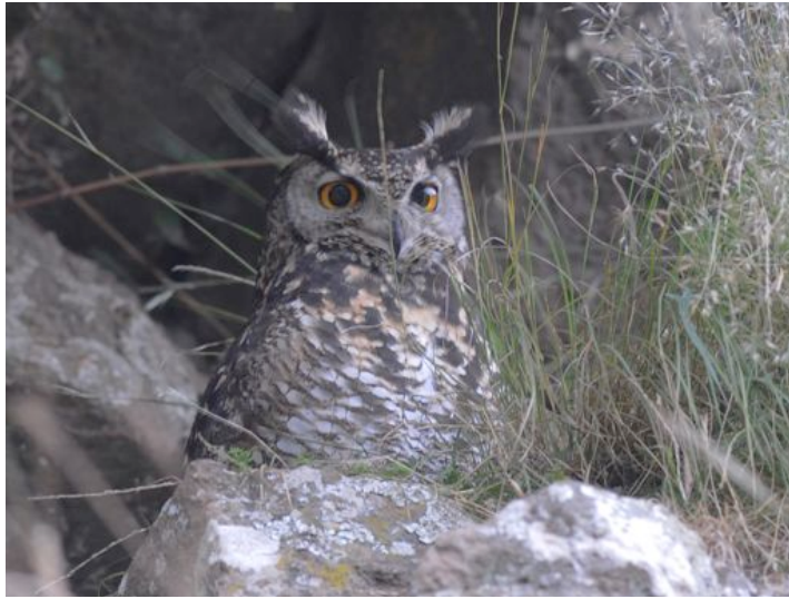
Cape Eagle Owl

Of course we stopped to pay our respects at the usual stake-out for Cape Eagle Owl , which this year required a scramble down into the little valley to look back up at the bird at its day roost below a