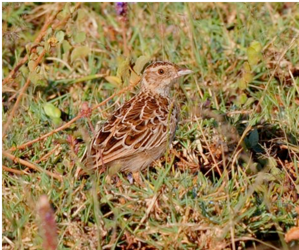
The very rare endemic Sidamo Lark

This was a really great day and could not have got off to a better start with a flock of 7 Abdim's Storks roosting beside the road – well it was a good sighting for 2 out of our 3 Landcruisers as one of our vehicles had to return to the hotel to retrieve a wallet. Perfect timing or what! Approaching the Liben Plains we stopped to scan a flock of hirundines perched on telegraph wires which turned out to be Ethiopian and the endemic White-tailed Swallows , and we had further flight views of both species over the next hour or so.