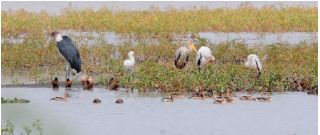
Marabou & Yellow-billed Storks, African Spoonbill and Fulvous Whistling-Ducks

Kingfishers, flyby Northern Carmine Bee-eaters , Ruppell's Glossy Starling and Kit had a Kittlitz's Plover .