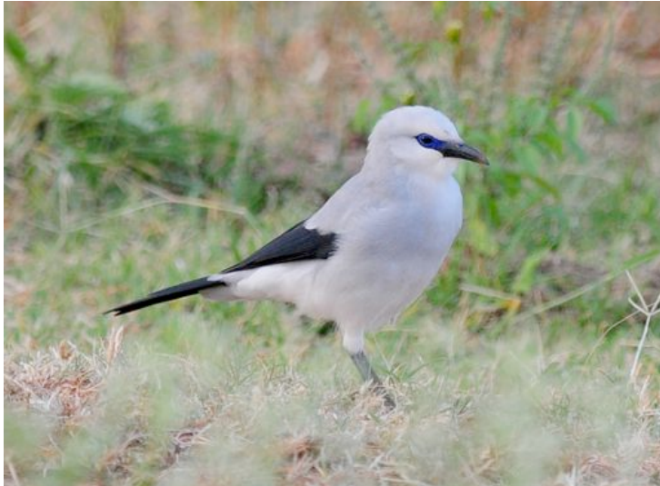
Stresemann's Bushcrow can only be found in southern Ethiopia