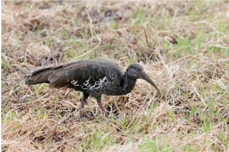
The endemic Wattled Ibis

Following a direct, overnight flight from London to Addis Ababa we arrived about half an hour early at 7am. So after clearing immigration and getting our baggage we met our local guide, Girum, and loaded our luggage into our 3 Toyota Landcruisers. Whilst I returned to the terminal to wait for Mike who was flying in from California the rest of the group notched up quite a few goodies around the airport including Dusky Turtle Dove , Thick-billed Raven , Grey-backed Fiscal , Greater Blue-eared