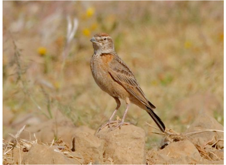
Another endemic - Erlanger's Lark

Driving towards Addis Ababa across the Sululta Plain and we still had a few species to find, which duly complied and the endemic Erlanger's Lark , the widespread Thekla Lark and several Red-breasted Wheatears were all found easily. A male Pallid Harrier was nice, as was a flyover Lammergeier , a group of Black-winged Lapwings and an Ortolan Bunting to end the day off nicely. We eventually reached our hotel in Addis Ababa around 6.30pm and enjoyed a fine evening meal, cold beers and long night's sleep.