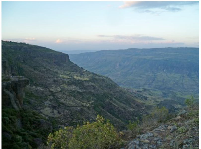
The stunning view at Debre Libanos

Our first stop was excellent as we had our first endemic Wattled Ibis , Blue-winged Goose , White-collared Pigeon , and Ethiopian Siskin . Some pools were full of water and held several Yellow-billed Ducks and at least 2 Hottentot Teals , Black Stork , African Sacred Ibis and Black-headed Heron , whilst waders present included a confiding Temminck's Stint , several Ruff , Black-winged Stilt , Wood and Green Sandpipers and a large flock of Spur-winged Lapwings . Best of all were several views of African Snipe , which seemed to outnumber the Common Snipes that were also present here. Walking across the field and around the edge of the pools yielded Egyptian Goose , many Blue-headed Wagtails and Red-throated Pipits , Brown-throated Martin , flocks of Red-rumped Swallows , Moorland Chat and a few Pied Wheatears . Many Yellow-billed Kites were present, along with quite a few Tawny Eagles , whilst overhead there was a Lanner , Hooded and Ruppell's Vultures , at least two classic Lammergeiers , and a perched Augur Buzzard was also very nice.