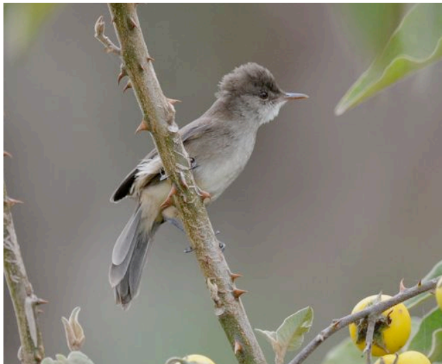
An agitated Lesser Swamp Warbler

Returning to the gardens we had a mad spell with birds everywhere as first of all a group of Black-billed Wood-Hoopoes were seen, followed by Red-fronted Tinkerbird , Northern Puffback , Black-headed Batis , Brown-throated Wattle-eye and Buff-bellied Warbler . Then it was time to search for Spotted Creeper , but it was hard as we kept getting distracted by more birds including Grey-headed Kingfisher , both Eurasian and Red-throated Wrynecks , Ethiopian Boubou , Northern Black Flycatcher , Cut-throat Finch , nest-building Bronze Mannikins and Grosbeak Weaver . Eventually we found a pair of Spotted Creepers as well to round off a really great pre-breakfast session.