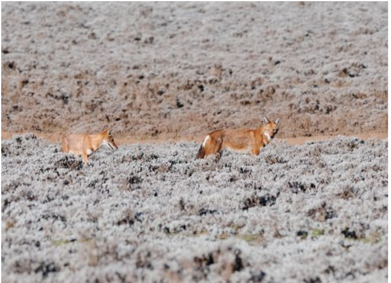
Ethiopian Wolves on the Sanetti Plateau

Tragelaphus buxtoni Oreotragus saltatrixoides Madoqua saltiana Madoqua guentheri Gazella granti Gazella soemmeringi Litocranius walleri Oryx beisa Stigmochelys pardalis Crocodylus niloticus Varanus indicus