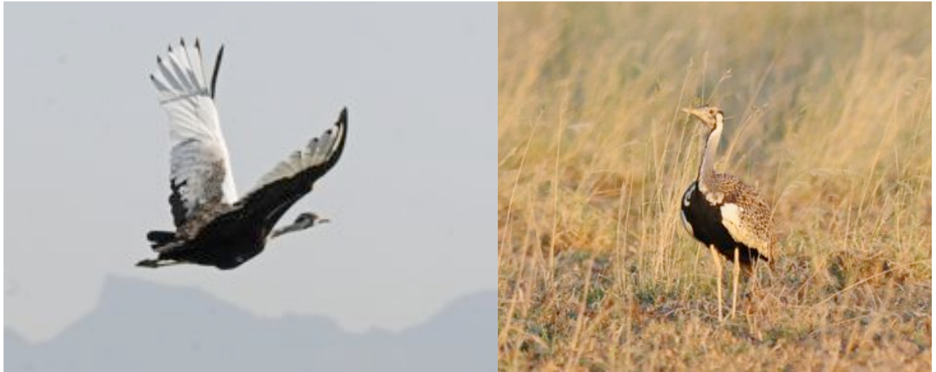
Hartlaub's Bustard at Awash National Park

Leaving Nazret early we reached the lava flow of the long dormant Fantale Crater volcano not too long after sunrise and it was still quite cool. Fortunately we managed to find the endemic Sombre Rock-Chat quite quickly and were treated to point-blank views of a pair perched on rocks right in front of us. In the same vicinity were several Shining Sunbirds , a breeding Ruppell's Weaver , Ethiopian Swallow and our first Purple Heron and African Palm Swifts . Checking out another site nearby and having our field breakfast proved to be a good move as the first of several Striolated Buntings appeared, followed by a pair of Chestnut-headed Sparrow-Larks . Nearby, there were a few Pied and Isabelline Wheatears , Steppe Grey Shrike , a perched Gabar Goshawk , flocks of Red-billed Quelea , Abyssinian Roller , and best of all a stonking Yellow-breasted Barbet .