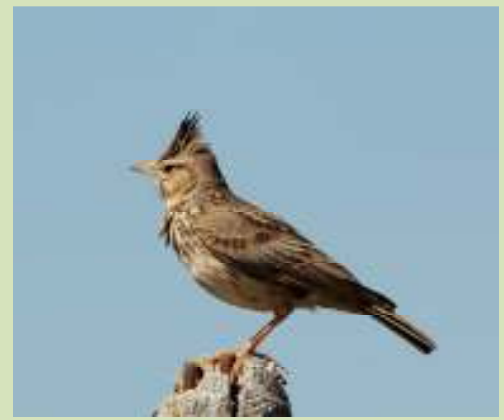
One of the commoner birds on the island we saw Crested larks everyday

This morning before breakfast we made a visit to Metochi Lake (Inland Lake). It's always best to visit early morning and we were not disappointed as we found at least 10 Little Bitterns , 4 Little Crakes , Red-rumped Swallows , Little Grebe , 12 or more Black-crowned Night Herons , Squacco Herons , several Sedge Warblers , and a couple of Great Reed Warblers that showed well. After a while, one