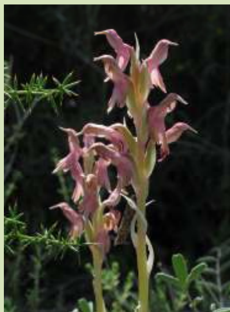
These Holy Orchids were found near the beach