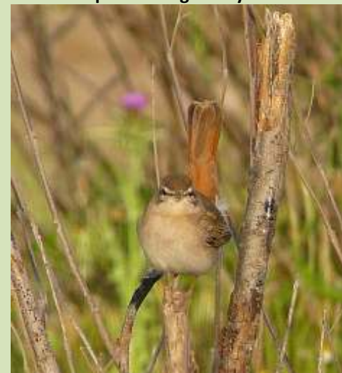
One of three Rufous Bush Robins seen together by the Tsiknias River