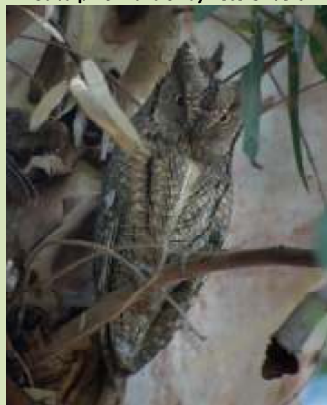
One of the Scops Owls that showed well to us