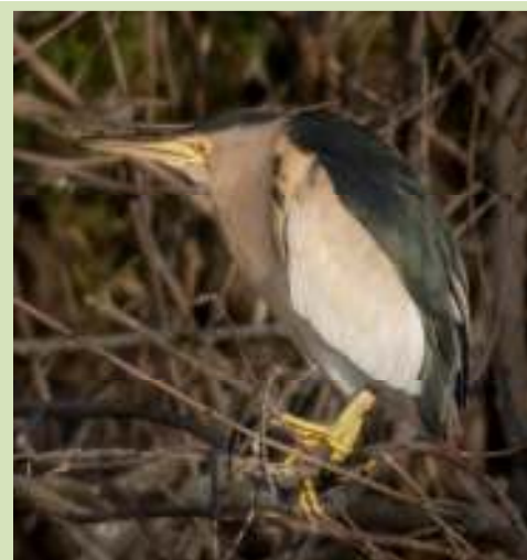
Little Bitterns were easy to see and we had as many as 10 in one place

Today we checked the Tsiknias (West) River before breakfast getting good views of a singing Nightingale , a