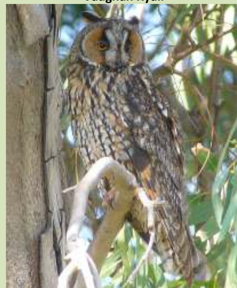
What great views we got of this adult Long-eared Owl