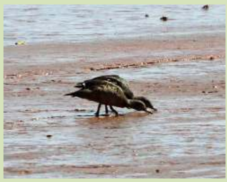
We found six rare and endangered Bernier's Teal on the Betsiboka river. If the tides are not right this can be a hard endemic to find