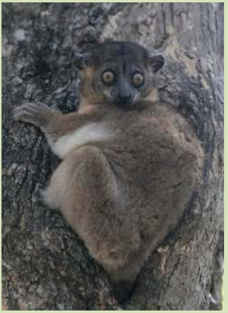
This Hubbard's Sportive Lemur was a good sport and showed well

This morning before breakfast we combed the grasslands of Isalo National Park once again for Madagascar Partridge. Searching the expanses of grass was like looking for a needle in a haystack but the surrounding scenery and cool morning air made it a pleasant