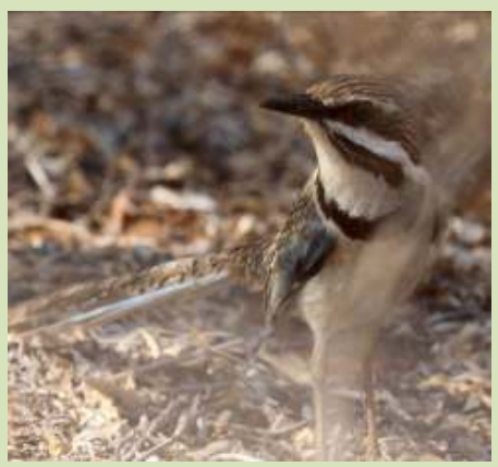
What a fantastic bird, this Long-tailed Ground-Roller gave superb views. Later we had a pair giving the most elaborate and fascinating display