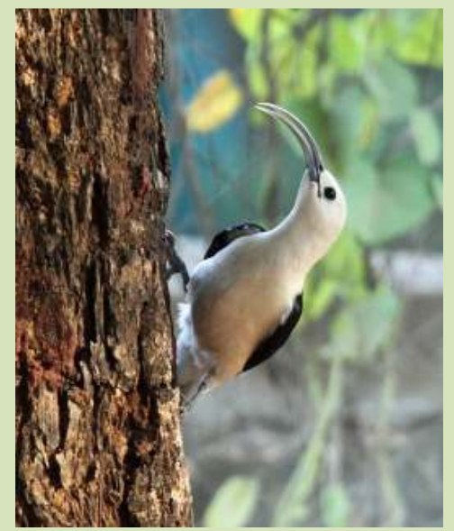
The strange looking Sickle-billed Vanga was one of the many Madagascar endemics we saw throughout our tour and part of the complete set of Vangas that all showed well

This was a fabulous trip to Madagascar where we saw just about everything that was possible on our comprehensive itinerary. Excellent views were had of most of the species we found and 96% of the birds and mammals seen were seen by everyone in the group, which shows our commitment to trying to get everyone to see everything and not just a few persons so as we can put it on our list. Highlights were numerous and the harder to get species eventually fell to us. All the Vangas, all the Couas, and all the Ground-Rollers, performed remarkably well, with particular note being made to the Scaly Ground-Roller that fed around our feet for about 40 minutes, Pitta-like, Long-tailed, Short-legged and Rufous-headed Ground-Rollers displaying or giving exceptional views. Red-shouldered Vanga at point blank range, Van Dams, Pollens, Nuthatch, Lafresnaye's and the amazing Sickle-billed Vanga all seen well, while Masoala produced the superb Helmet Vanga and rare Bernier's Vanga. A Collared Nightjar was seen camouflaged in the leaf litter, owls on day roosts, the memories just go on. To top it off we saw 26 species of Lemur, 2 Tenrecs, Leaf-tailed Gecko, Tomato Frog and more! Our ground arrangements were second to none resulting in a perfectly floorless itinerary.