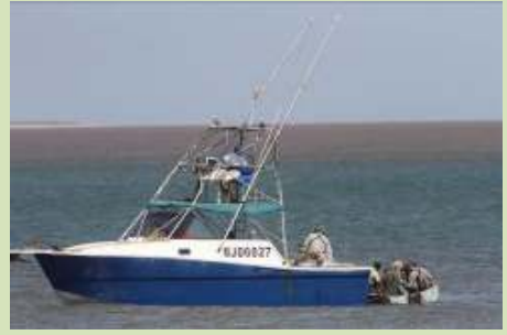
Our comfortable boat took us in search of two Madagascar rarities on the Betsiboka River