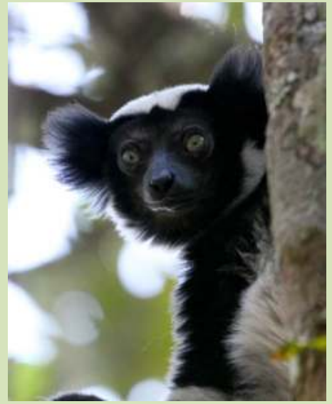
The superb Indri was not only fabulous to look at but also provided us with lasting memories of its incredibly loud and evocative call