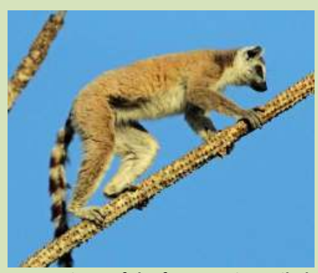
Great views of the famous Ring-tailed Lemurs of Berenty