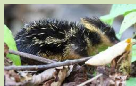
Our second tenrec of the trip this Lowland Streaked Tenrec was found by one of the lodge workers