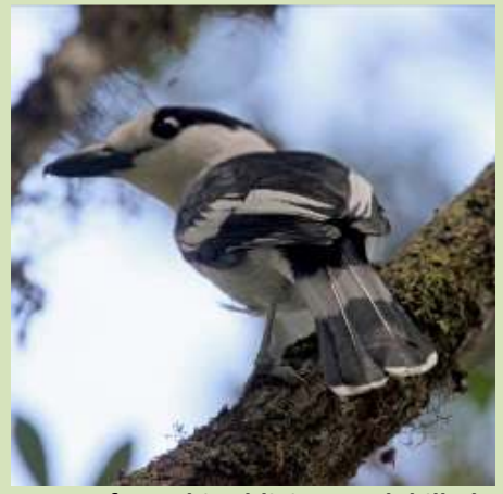
Apart from this obliging Hook-billed Vanga the forest was rather quiet