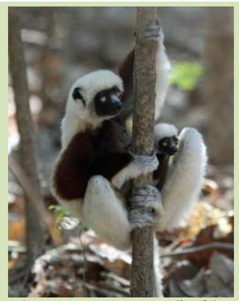
The very attractive Coquerel's Sifaka including this one with a baby was our first of 26 Lemur species of the trip

This morning we gathered just after dawn for an early prebreakfast walk in the dry deciduous forests of Ankarafantsika Reserve. It was another stunning, cloudless day and from the car park, two Madagascar Hoopoes were spotted in a tree and then flew down on the ground giving good views, and also uttering their strange purring call. We boarded the bus and drove a short distance past the lake to another trail which produced a pair of Cuckoo Rollers almost immediately. The bonus here was another Banded Kestrel that flew in and seemed to be interacting with the Cuckoo Rollers chasing them from perch to perch and all of this happened at quite close range. Further on we heard a pair of White-breasted Mesites calling and soon they were in our sights crossing the path in front of us. Mark spotted two Madagascar Harrier Hawks and as we looked at those, a Schlegel's Asity appeared in the midcanopy where it showed well. Two more Schlegel's appeared in the area and offered great views and photo opportunities. A pair of nearby Common Jeries could not compete with the Asities which were spotted again a little further down the path. Continuing on, there was a very large fruiting tree that played host to several Madagascar Bulbuls as well as at least two Madagascar Green Pigeons . A Hook-billed Vanga was calling and showed like a white beacon as it perched in the morning sun on top of a large