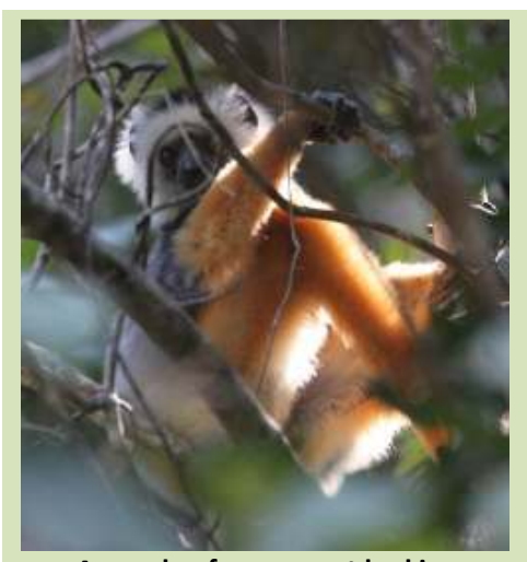
A couple of very smart looking Diademed Sifakas posed for us along the roadside at Perinet