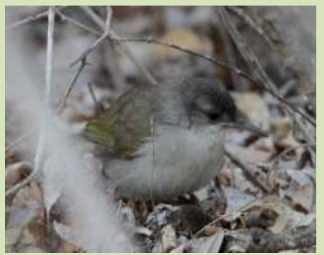
This Thamnornis Warbler showed well but looked nothing like the illustrations