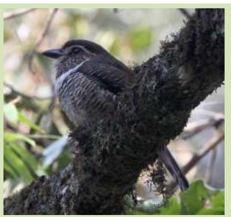
This Short-legged Ground-Roller took a bit of finding but eventually rewarded us with fabulous views. This can be one of the hard birds to find so we were delighted everyone saw it