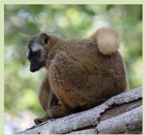
There were plenty of Red-fronted Brown Lemurs to be seen