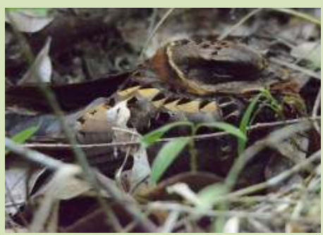
What camouflage! This Collared Nightjar was a top bird for all of us.