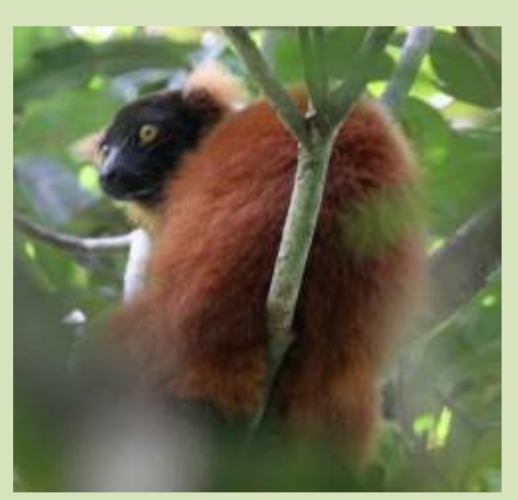
Red-ruffed Lemurs were beautiful, noisy and seen many times in Masoala