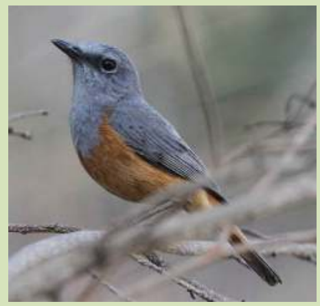
With a little bit of patience this Benson's Rock Thrush came in close and posed for super views