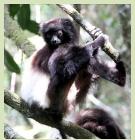
A small group of Milne Edwards Sifakas entertained us in the forest at Ranomafana