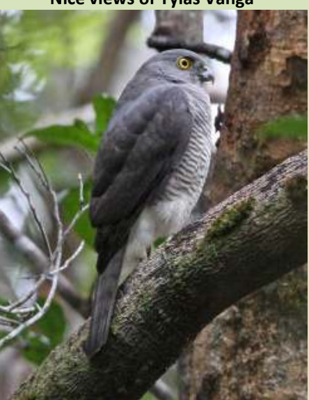
This Frances's Sparrowhawk is a bird often misidentified as Madagascar Sparrowhawk.