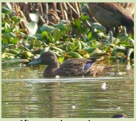
After several near misses we eventually found three Meller's Ducks on a pond near Tana