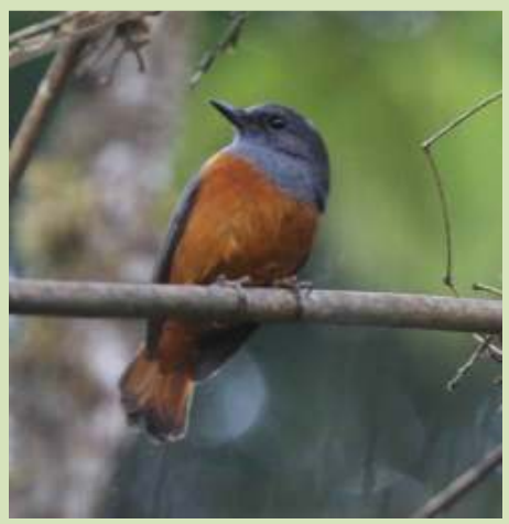
It took a while before this Forest Rock Thrush put in an appearance

Our early breakfast on the veranda was delightful with our first cooked eggs of the trip! There were several moths that had come in overnight and we inspected several and photographed a few. Then we were off to Ranomafana National Park for the day. As we got off the bus in the car park, our local guide immediately pointed out a Rand's Warbler perched high in a distant tree. It was a bit far away (or was it very small?), but over the next two days we had plenty of great views of several closer singing birds. A couple of Blue Pigeons flew over as we headed into the forest, and continuing our walk we made our way along the winding trails and eventually came to a hillside where a Red-fronted Coua was spotted walking close to the path. The bird came toward us and then jumped up into a tree and ascended into the canopy all within feet of us! Next up was a White-throated Oxylabes that worked the forest floor and eventually gave good views very close to the trail. Further along we had nice views of Ashy Cuckoo-Shrike and Long-billed Bernieria. We continued our walk up along the edge of a deep ravine where a Madagascar Pygmy Kingfisher was spotted perched on a branch, while several Madagascar Paradise Flycatchers flew around and a Dark Newtonia played hard to get. We hoped to