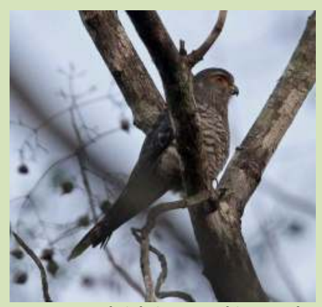
A very good sighting was this superb Banded Kestrel a species that is often missed