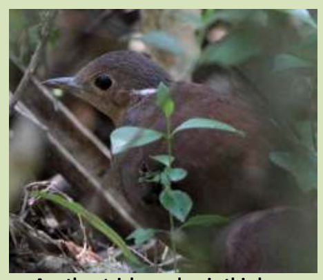
Another tricky endemic this lone Brown Mesite was watched well at close range. Thanks go to our local guides who worked hard to find this bird for us