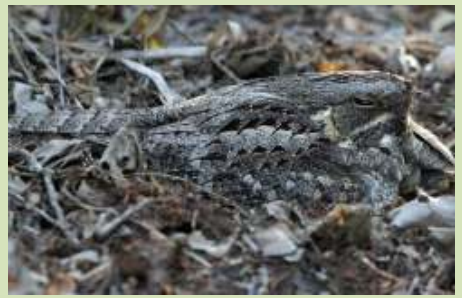
In the Spiny forest of Berenty we got great views of this Madagascar Nightjar sat with a chick