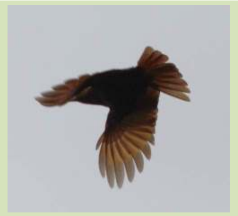
Not a very good photo but a very rare bird this female Bernier's Vanga flew over and landed in a tree nearby where we enjoyed great views

This morning we walked along the beach to access another area of the reserve with the promise of getting better views of Scaly Ground-Roller . It was another gorgeous day with spectacular views across the bay. We made our way up the trail and soon heard a Madagascar Wood Rail calling. It didn't take long before we coaxed this bird out of the forest to cross the trail for good views, before ducking back into the undergrowth. A little further along was a Lowland Red Forest Rat that seemed unbothered by us as it foraged on the forest floor. We sat for some time while the local guides and Steve searched for the Ground-Roller. A Blue Coua was seen and we were entertained by several Cuckoo-Rollers in the trees above beating some large. hairy caterpillars against the tree branches and then eating them. No Ground-Rollers were found or heard so we moved to another trail near a stream where suddenly one was heard calling. We approached slowly and found it still calling perched on a low branch. The bird proceeded to give us an amazing show as it ascended to a higher, more open branch and called for several