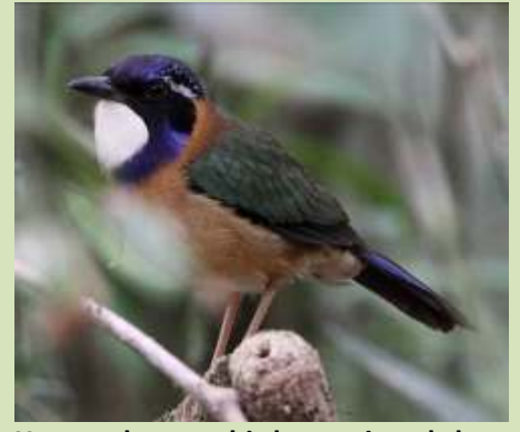
Yet another star bird we enjoyed close views of this Pitta-like Ground-Roller displaying and calling. It was the second of the 5 species that we saw well and a welcome sighting by all