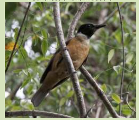
Nice views of Tylas Vanga