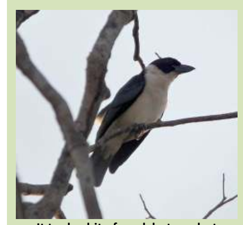
It took a bit of work but our last speciality of the Ankarafantsika Reserve was the rare Van Dams Vanga which gave super views in the end