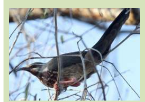
What a bird! This female Subdesert Mesite sat motionless for us to enjoy the most perfect of views sat in a tree about 10ft up.