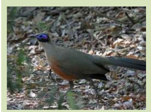
Giant Couas were actually easy to see and confiding in Berenty with good views of many during our stay