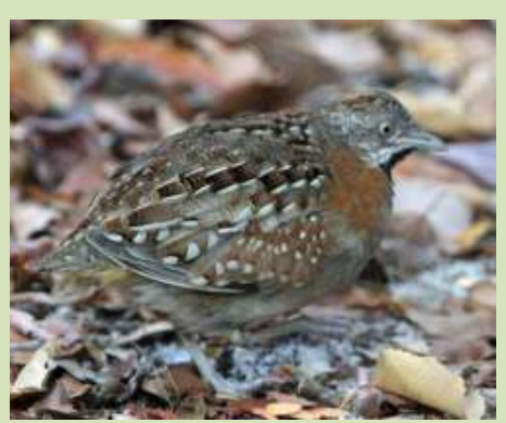
Several very confiding Madagascar Buttonquails gave good views in the forest leaf litter