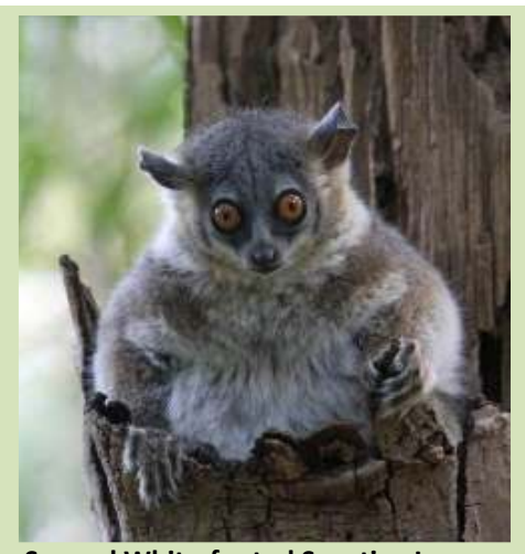
Several White-footed Sportive Lemurs gave wonderful photo opportunities and always looked surprised and cute. Although this individual looked as though it was too fat and jammed into its hole!