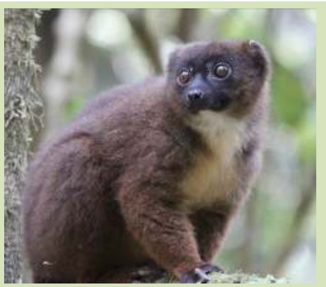
We were all fascinated by this superb Red-bellied Lemur that came down to drink from the stream beside us

This morning we enjoyed another fried egg breakfast while marveling at two huge Comet Moths that had come into the hotel lights overnight. Then we spent our second full day at