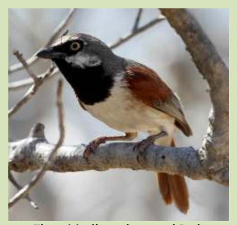
The critically endangered Redshouldered Vanga gave stunning close views in the dry thorn scrub near Tulear. Only discovered in 1997 the habitat for this species is being destroyed at an alarming rate