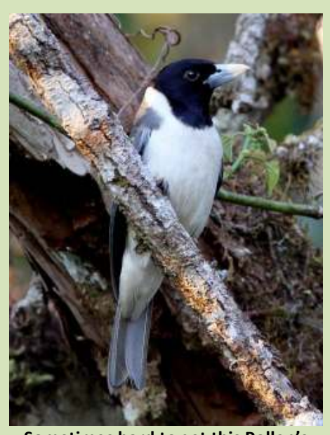
Sometimes hard to get this Pollen's Vanga gave stunning views at Ranomafana