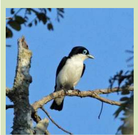
This Chabert's Vanga posed very nicely for us in the evening sunlight