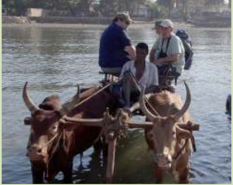
Our Zebu rides out to our waiting boat was a unique experience