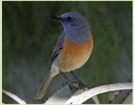
This Littoral Rock Thrush could easily be seen around our idyllic beach side accommodation