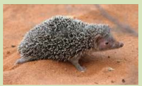
What a cutie, this Lesser Hedgehog Tenrec delighted us all