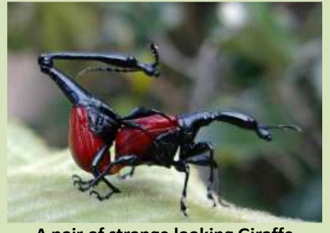
A pair of strange looking Giraffe Weevils were caught mating