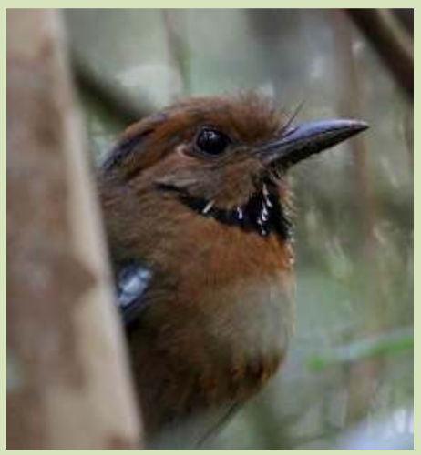
At last stunning views of a Rufousheaded Ground-Roller. Lots of groups missed this species this year! But not us

This morning we were in the forest early to make the most of our last few hours at Ranomafana. The regular chorus of Rand's Warbler, Madagascar Lesser Cuckoo, Madagascar Coucal, Crested Drongo and Cuckoo-Roller provided background music