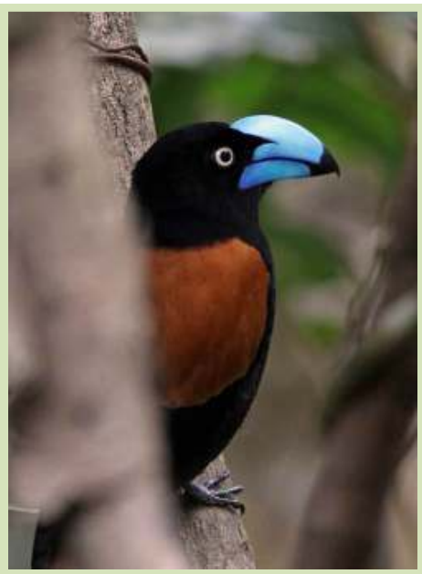
What a bird! And one of the highlights of the entire tour. This Helmet Vanga gave superb prolonged views in the hot forest of the Masoala

This morning we took one of the boats a few minutes up the coast to access another area of woodland. We ambled over the lava rock trail into the forest and found a nice looking Tylas Vanga and a close Broad-billed Roller. A very obliging male Frances's Sparrowhawk was initially identified as a Madagascar Sparrowhawk, and found just above eye level perched on a tree branch allowing plenty of time to run through the correct id features, and nearby there was Spectacled Tetraka flitting around. Our morning was to be devoted to finding a very special target, the Bernier's Vanga, a bird only recently rediscovered in this area of Madagascar. We reached an open area that had been altered into farmland and it allowed good views of the forest edge and tree tops. There were several Chabert's Vangas moving through the trees, feeding in a flock, and then mobbing a couple of Cattle Egrets that were flying through. A few Madagascar Pratincoles were seen as well as Madagascar Red Fodies and