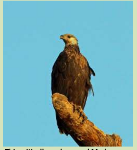
This critically endangered Madagascar Fish Eagle posed perfectly on this dead tree. One of the world's rarest raptors its population is estimated at just 240 mature individuals