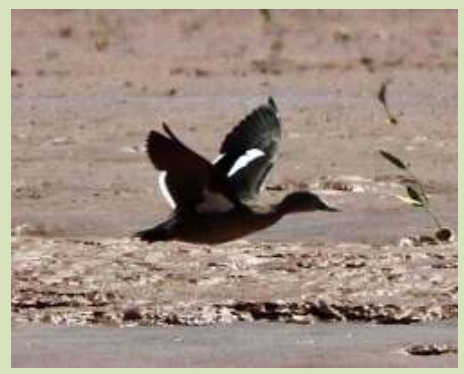
Bernier's Teal in flight