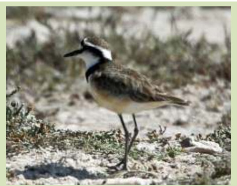
This Madagascar Plover was one of a nesting pair found at Ifaty

This morning after breakfast we went down to the coast to catch our speedboat out to the uninhabited islet of Nosy Ve. The first part of the adventure involved a ride on a Zebu cart from the pier out to the waiting boat. The cows pulled us through the water delivering us dry and safe to the boat. Then we cruised across the bay toward the sandy island. It was another sparkling clear day and the water was a gorgeous tropical blue. Some flying fish were seen jumping out of the water and as we slowed down just off the island shore, we spotted some Red-tailed Tropicbirds flying over and a