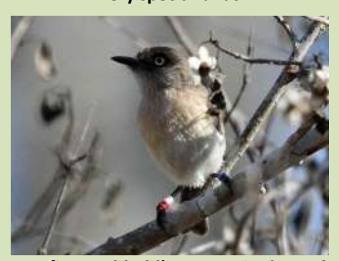
Our first Archbold's Newtonia showed well, and seemed to be the subject of a ringing programme