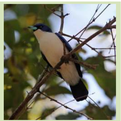
A very nice pair of Blue Vangas were a delight to see and came in for close looks at us!