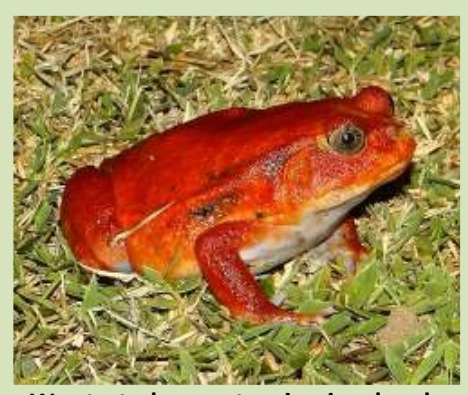
We started our extension in a lovely coastal hotel where we were shown this fabulous Tomato Frog