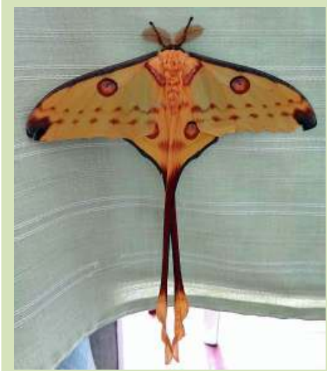
There were some pretty spectacular moths around our breakfast table, but none more so than this huge Madagascar Comet