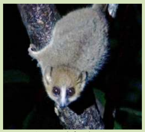
An evening search for the tiny Brown Mouse Lemur provided superb close views as several came to feed on Bananas smeared onto a tree