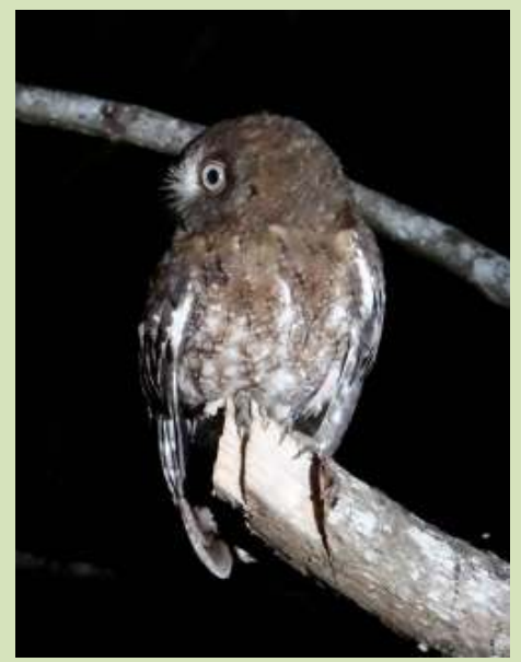
After a night walk in the forest we came back to the lodge and found this Rainforest Scops-Owl posing nicely on a tree by one of the cabins