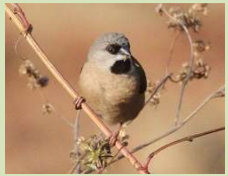
Our first walk from our city hotel found us a bunch of good birds including close views of Madagascar Munias.