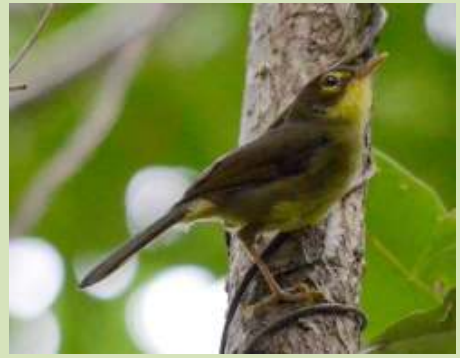
When we first saw this Tetraka we were sure it was the rare Dusky Tetraka but a look at the photo and finding out that the illustration in the lan Sinclair book is wrong, drew us to the conclusion that this was the often mistaken dark form of Spectacled Tetraka