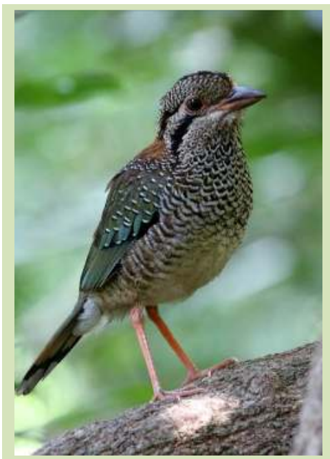
One of the birds of the trip this Scaly Ground-Roller gave stunning views almost at our feet for 40 minutes

After a visit to a local market, we returned to our hotel for lunch and then in the afternoon we drove to the nearby Tsarasaotra. Not expecting too much we were pleasantly surprised at the masses of waterbirds and herons on show. Countless Red-billed Teals , outnumbered the White-headed Whistling Ducks and a few Hottentot Teals . There were lots of Black-crowned Night Herons , a few Black Egrets , Squacco Herons displaying and nesting, several Dimorphic Egrets , and a couple of White-throated Rails . Our crowning glory for our last hour of birding was when Gina spotted a Meller's Duck hidden amongst the commoner waterfowl. We eventually found three and enjoyed watching this drab endemic especially as we had previously come