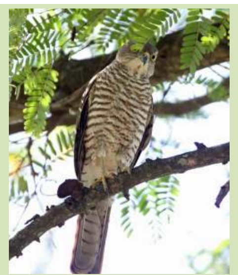
This female Frances's Sparrowhawk perched very briefly and then flew off! We saw plenty more during the tour

night ending a very exciting nocturnal visit to the forest.