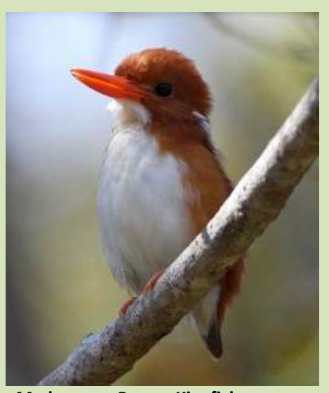
Madagascar Pygmy Kingfishers were seen on numerous occasions and were always a delight to see and photograph