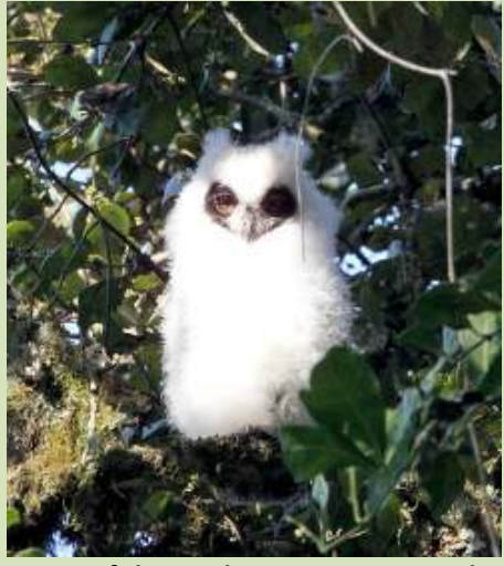
One of the Madagascar Long-eared Owl chicks that stood out like a light bulb high up in a tree at Perinet. Another chick and the adult were perched nearby