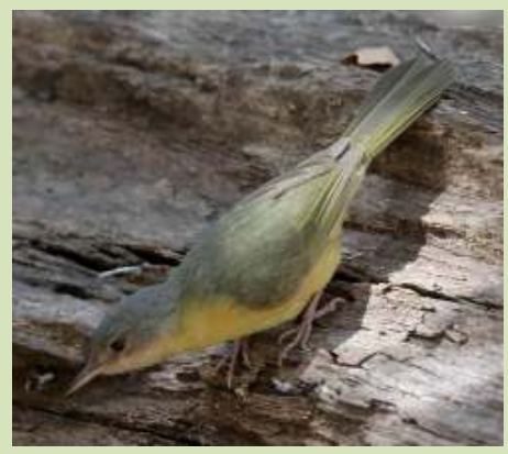
It took some work before we got superb close views of two rare Appert's Tetrakas. This pair eventually came to within just a few feet of us