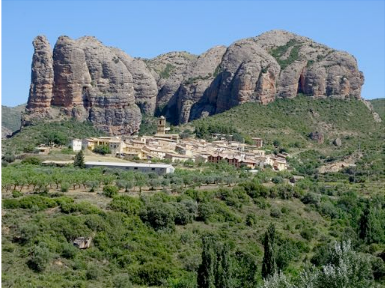
The bushes here were alive with warblers.

We left our wonderful, secluded hotel high up in the Hecho Valley and headed down to pastures new, stopping amongst some arable fields to look for Ortolan Bunting again, but only hearing it this time. There were plenty of Corn Buntings , a few Cirl Buntings , and a fabulous Queen of Spain Fritillary . Moving on we paid a visit to a small craggy area where a fruiting bush held 2 Western Orphean Warblers , 2 Subalpine Warblers and a male Sardinian Warbler . A male Blue Rock Thrush was found on a cliff face, and 3 Peregrines , Eurasian Griffons and Egyptian Vultures soared in the clear blue sky. We'd already seen Short-toed and Booted Eagles , Common Buzzard , along with many Red and Black Kites so far today.