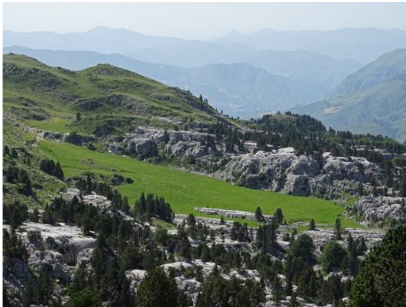
The Roncal Valley

Well another 8am breakfast before heading out for another relaxing day in the Spanish Pyrenees. A male Red Crossbill calling from the conifers at the edge of the car park was a bit of a surprise before leaving and