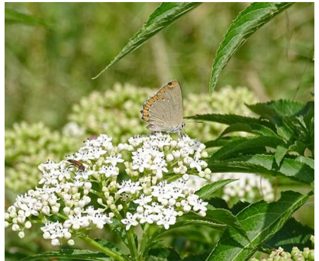
Spanish Purple Hairstreak