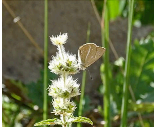
Ripart's Anomalous Blue