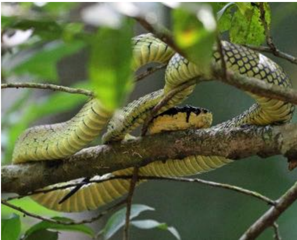
Green Pit Viper