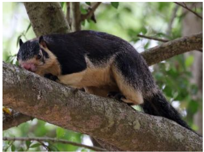
Sri Lanka Giant Squirrel