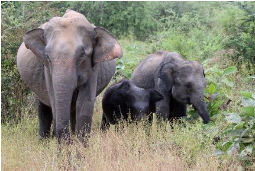
Sri Lanka Elephants