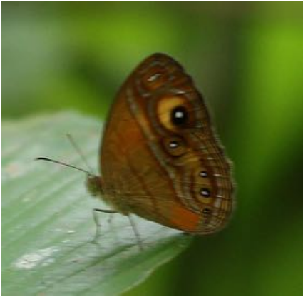
Glad-eyed Bush Brown