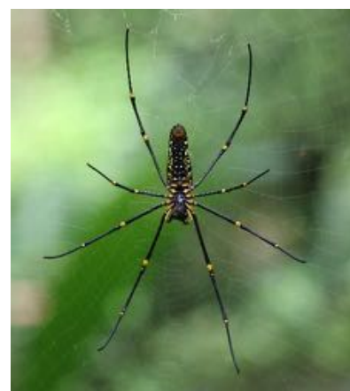
Giant Wood Spider