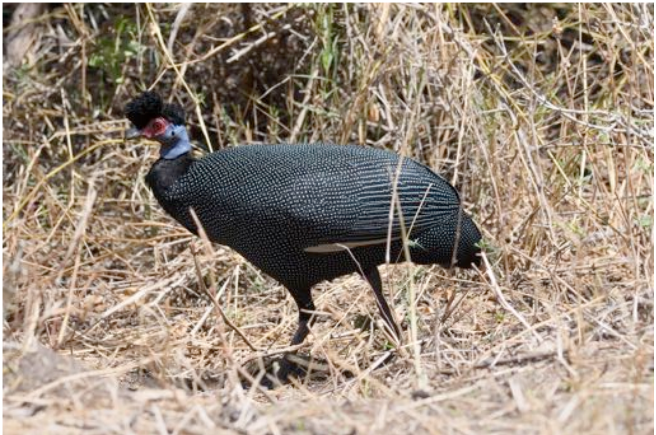
Crested Guinea fowl

At our lunch spot we walked out onto the boardwalk into the lake and found 20+ Chestnut-banded Plovers with some very close birds. Also here were Three-banded Plover, Curlew Sandpiper, Lesser Sandplover, Pied Avocet and lots of Little Stints . With clear blue skies this was the hottest, driest day of the tour so far and we were certainly feeling the heat. So had lunch in the shade before continuing on but the next few hours were pretty quiet, apart from nesting Holub's Golden Weavers, Bateleur , and a group of scarce Crested Guinea fowl . Result!