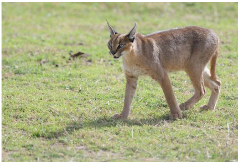
Caracal - nobody expected this!

After a toilet stop we drove out into the plains where amazingly we found another Caracal , albeit quite distant. We also saw Pectoral-patch Cisticola , Black-bellied Bustard , Spotted Hyena , a confiding Rosy-breasted Longclaw , Montagu's Harrier , another sleeping Lion , some African Quailfinches coming to drink in a stream, before heading to the Hippo Pools. Needless to say they were full of Hippos and some waterbirds but with rain threatening we drove to the picnic site. Here there were many Fan-tailed Widowbirds in non-breeding dress, African Fish-Eagles , flocks of Red-billed Queleas and a hunting African Hobby .