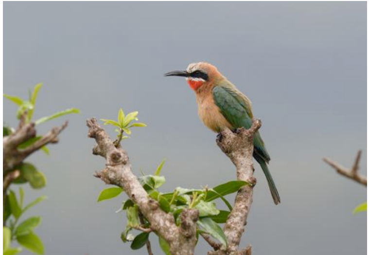
White-fronted Bee-eater is a common but stunning bird

As we left the tarmac and followed the dirt track to the lodge we saw our first Ashy Starlings , a Black-chested snake-Eagle and some other commoner birds, but we were on a mission for a two o'clock lunch. Well, we reached the lodge which was pretty secluded, lunch was naturally late as the staff didn't seem to be expecting us, so we made the best of things and scanned from the verandah that overlooked a drinking pool and typical 'bush country'. From here we saw a D'Arnaud's Barbet visiting a nest hole beside the swimming pool, a few endemic Yellow-collared Lovebirds , White-billed Buffalo-Weaver , flocks of Wattled Starlings and a Brown Snake-eagle . After lunch and some Blue-capped Cordon-bleu's we took a short walk into the bush. Another Pearl-spotted Owlet appeared, along with Northern Red-billed and African Grey Hornbills , Speckle-fronted Weaver , Spotting Mourning-Thrush , Red-cheeked Cordon-bleu , near-endemic Rufous-tailed Weavers , Long-tailed Fiscal , and we ended with a pair of inquisitive White-bellied Bustards .