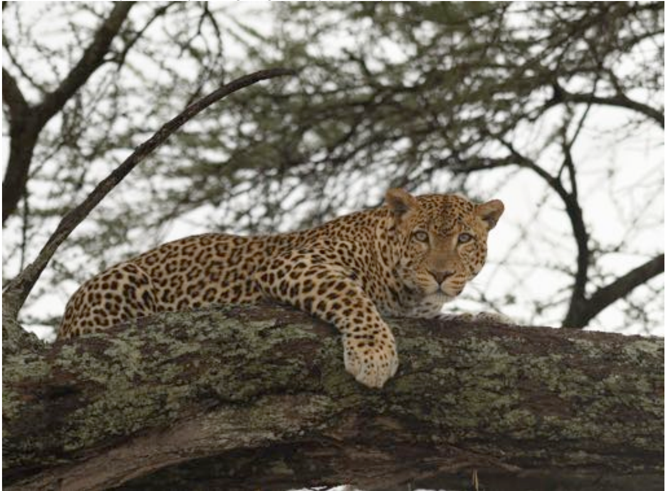
This Leopard provided one of the highlights of the tour

We got to the picnic site overlooking Silale Swamp just in time to connect with a heavy rainshower. James found a Chameleon and we enjoyed close flybys from numerous Collared Pratincoles . After we'd eaten we followed the dry swamp, trying to find some water and along the way found an adult and a large grown juvenile Verreaux's Eagle-Owl . At some narrow water margins we had 3 Saddle-billed Storks , Black Stork ,