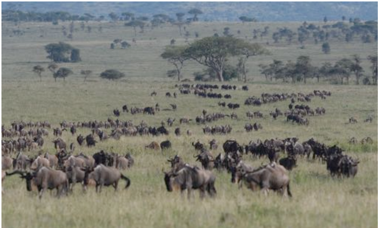
Witnessing the amazing Wildebeest migration was definitely a tour highlight