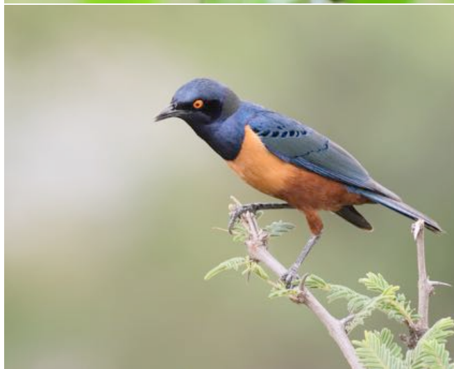
Photos clockwise: Black-bellied Bustard, Red-backed Manakin, Hildebrandt's Starling, Coqui Francolin, Usambiro Barbet and White-bellied Bustard.