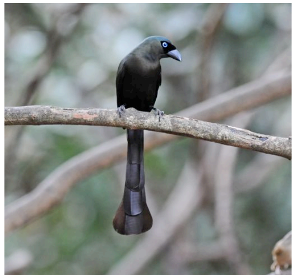
Racket-tailed Treepie - Kaeng Krachen