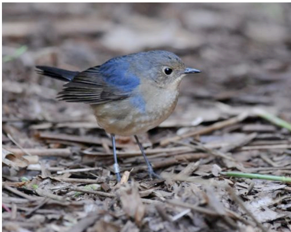
Firethroat - 1st for Thailand

Today we headed to the Golden Triangle area and after a 5am departure we reached a small reserve near Chiang Saen Lake shortly after sunrise at 7am. We had taken something of a gamble coming here but were quickly rewarded with views of a Brown-cheeked Rail (also known as Eastern Water Rail ) – a split from the more familiar species seen in Europe. It was working its way along a narrow channel at the back of a muddy area and often obscured by tall grasses but with persistence we had decent views, although not as good as a much closer bird later today! At the same marshy spot we also had a pair of Ruddy-breasted Crakes feeding out in the open and showing rather well. Moving on, we followed a path along a channel filled with water and as we crossed a clearing a bird flew across that set alarm bells ringing. In the brief glimpse I had I thought it looked like the Firethroat that had first been seen at the end of December. However, knowing that it was extremely elusive and some birders had spent days looking for it, I thought “what are the chances...” But when your luck is in – it is well and truly in, as shortly after it began singing! And after half an hour or so of waiting patiently, the bird began to reveal itself and we had brief glimpses in the dense tangle along the water's edge. But it never came right out into the open, which was a bit frustrating.