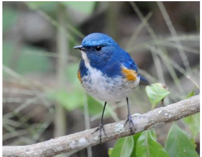
Male Himalayan Bluetail

A rather quiet day by Doi Lang standards started with a calling Giant Nuthatch beside the road, with a pair of Rusty-cheeked Scimitar-babblers , 3 Olive-backed Pipits and a brief Chestnut Bunting nearby. The top forest held a large flock that we just caught the tail-end of with several Grey-headed Parrotbills , Short-billed Minivet , Black-winged Cuckooshrike , Rufous-backed Sibia and others. Along the road a flock of Grey-cheeked Fulvettas held both Golden and Rufous-fronted Babblers . The Spot-breasted Parrotbill was also in attendance, along with Himalayan Bluetail , Siberian Rubythroat , and a few Silver-eared Laughingthrushes .