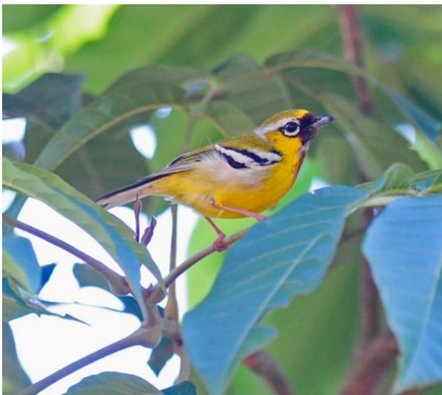
Clicking Shrike-Babbler - Doi Inthanon