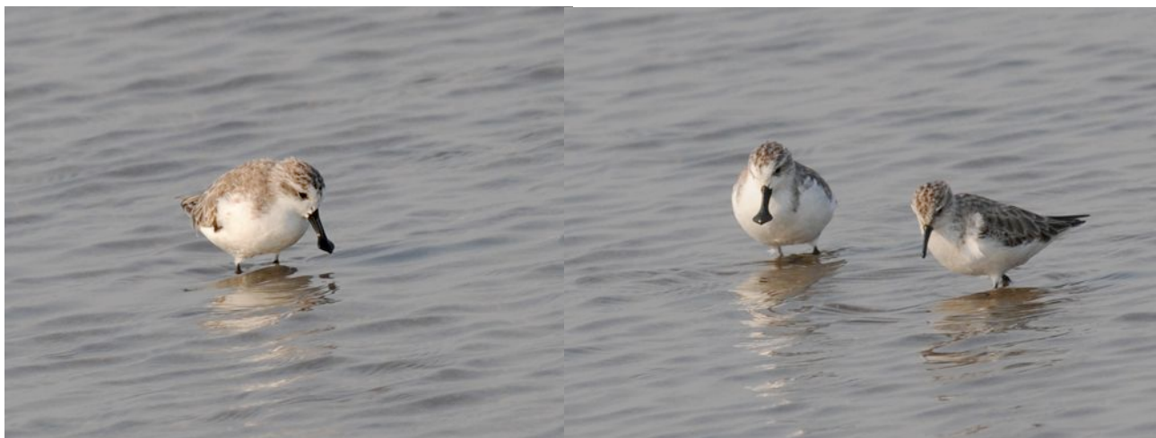
We were pleasantly surprised to see 6 Spoon-billed Sandpipers this morning.

It is always a highlight of our Thailand tour to visit the shorebird mecca of Pak Thale and today did not disappoint because within literally a few seconds of setting up our scopes we were watching the first of six Spoon-billed Sandpipers seen this morning. In fact all six were in the same saltpan right in front of us at one stage and we spent a rather long time soaking up the views of this mega, which is classified as Critically Endangered by BirdLife International. It's always a trifle difficult to focus on one species here as there are just so many birds present, but this is such a rare bird and we were treated to the best views I've ever had here.