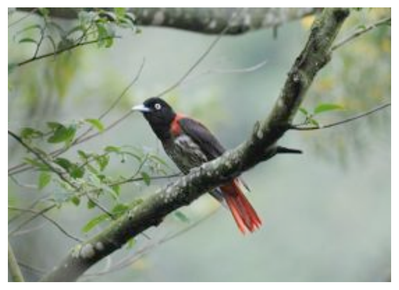
This Taiwan (Red) Oriole showed well at Huben.