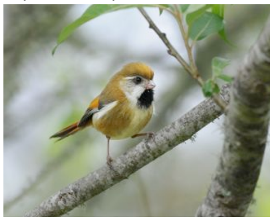
Golden Parrotbill - a potential future split.

After a bit of birding in the garden we drove off up into the dizzy heights of Alishan where we saw plenty of previously seen endemics and other species, but our main aim was to find parrotbills and bullfinches. As it turned out the Golden Parrotbills came in right on cue and gave mindblowingly prolonged views and much better than on my previous visit, with at least 5 birds lingering in some roadside bushes. What cuties! We then spent the remainder of the day. some 7 hours searching for bullfinches without any joy. Well that's birding and we did at least try - very hard. In fact in the afternoon we had thick mist. low