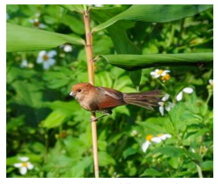
Vinous-throated Parrotbill at Dasyueshan

leisure. As an aside, I was a little surprised to see blue skies and boy was it warm (!), especially after the heavy overnight rain. Despite this, there was a lot of bird activity with Pacific Swallows, House Swifts, Striated Swallows, and a few Silverbacked Needletails overhead, as well as lots of Vinous-throated Parrotbills, Plain Prinias, Chinese Bulbuls, Javan Mynas, Taiwan Barbet, Black-naped Monarch, Grev Treepie and Oriental Cuckoo all being noted. Best of all though, was a pair of Taiwan Scimitar-babblers that responded very well to the ipod and I managed a decent, albeit distant, record shot. A short drive up the road to a fruiting