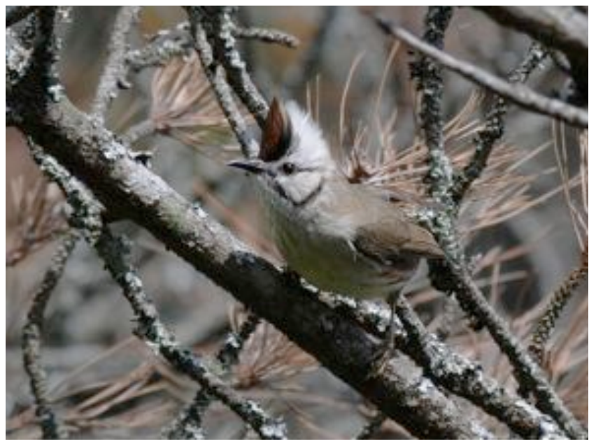
Taiwan Yuhina is a common endemic of higher areas.