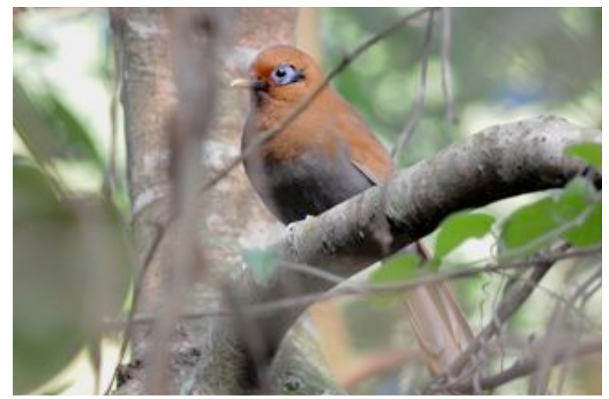
Rusty Laughingthrush is one of the shyer endemics