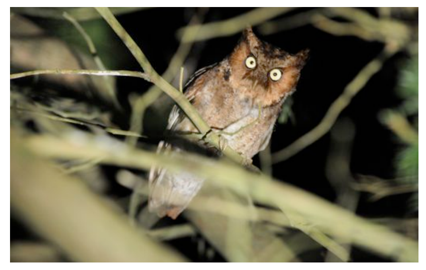
Mountain Scops-owl was easily seen again this year.