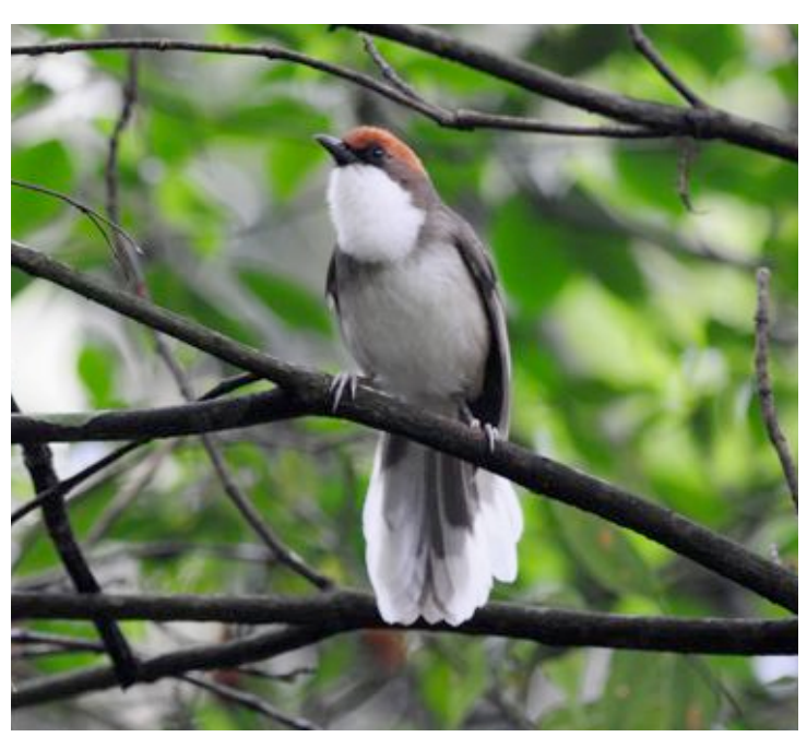
Rufous-crowned Laughingthrush at Dasyueshan

A few of us got up early and birded the gardens in much clearer conditions than we'd experienced so far - and even had a bit of blue sky. The male Pale Thrush showed quite well feeding along a path, David and Ian had Taiwan Barwing, and there were plenty of other birds around this morning as well. I knew it was going to be one of those days when I saw a Scaly Thrush and Ashy Woodpigeon and no one else got onto them. Anyway, we left after breakfast and slowly made our way down the mountain, but it took too long as we waited for a while for Little Forktail to show without any joy, then a puncture delayed us further but we did get a Taiwan (Vivid) Niltava during the