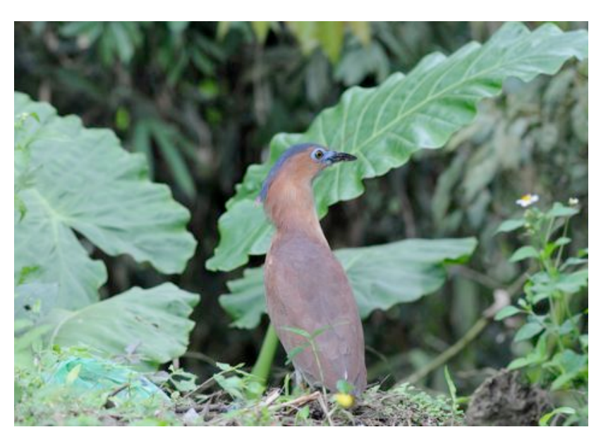
Malayan Night-Heron at Huben

bushes, with a possible Eastern Crowned Warbler showing even less and not being