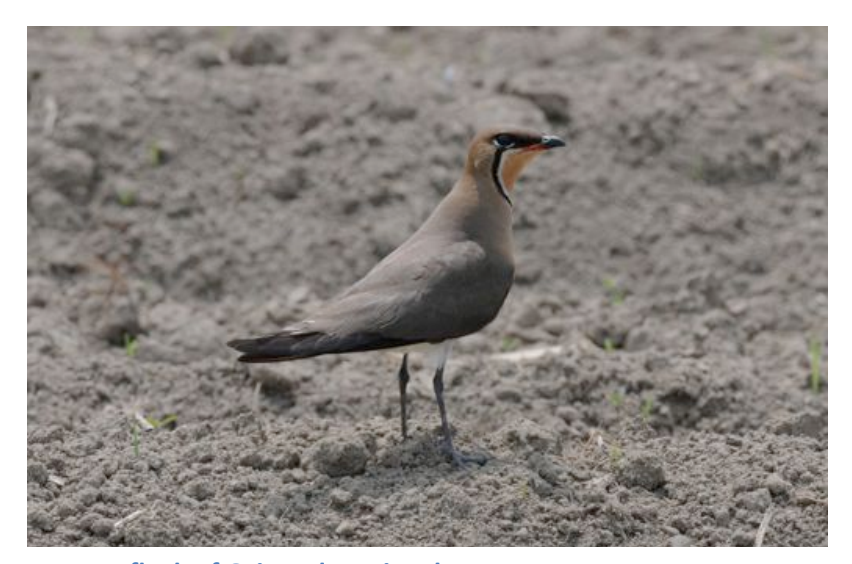
A flock of Oriental Pratincoles were seen on passage.