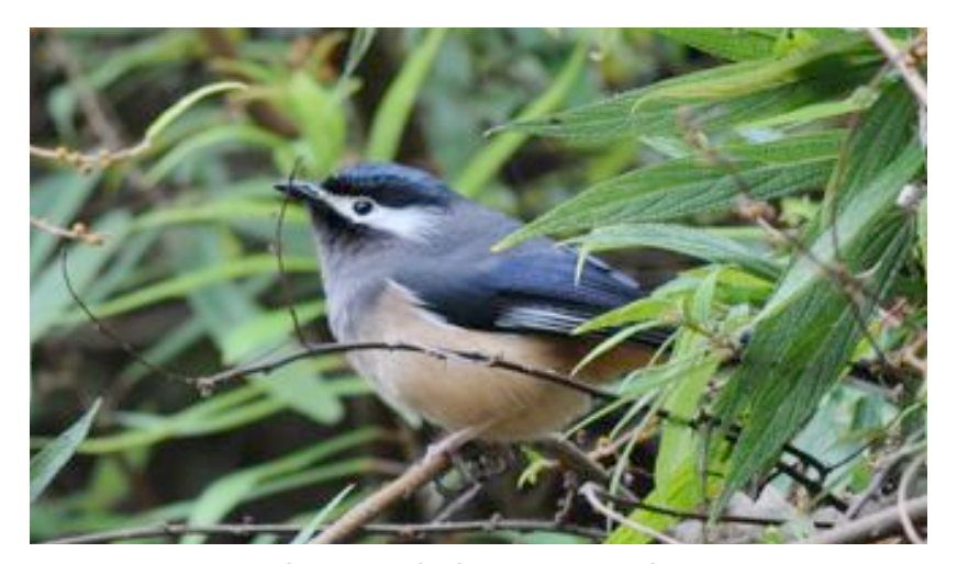
White-eared Sibia at Dasyueshan