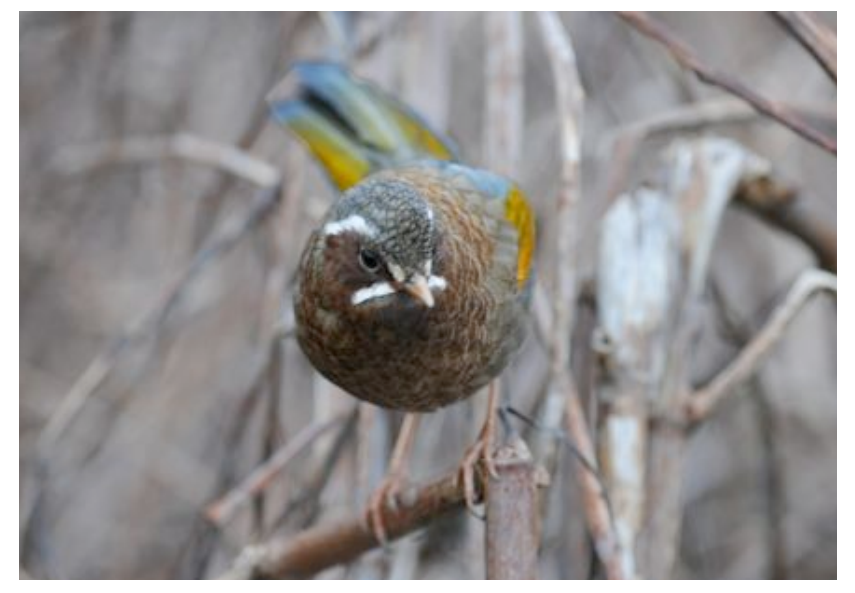
White-whiskered Laughingthrush is an endemic of high elevations