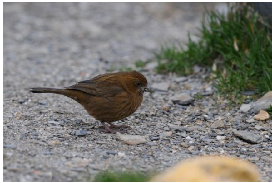
Taiwan Rosefinch - a potential split