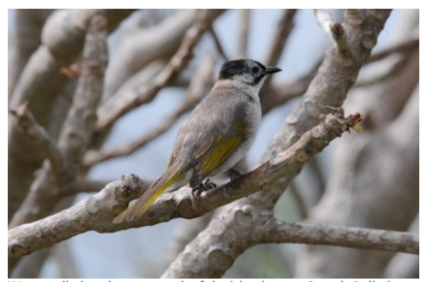
We travelled to the very south of the island to see Styan's Bulbul