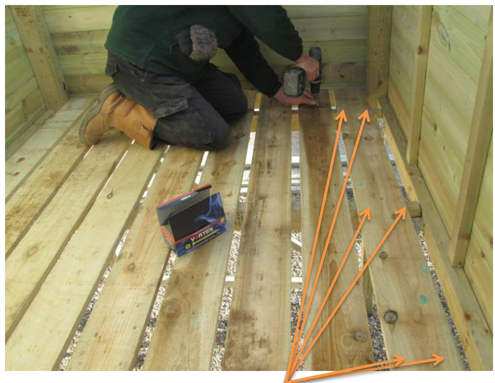
Evenly space out the 9 number 1.8m long 6x1 floor boards and fix down with 2 x 70mm screws at each floor bearer location