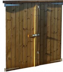
Workshop paired doors Full frame & TGV Clad- 56" wide -