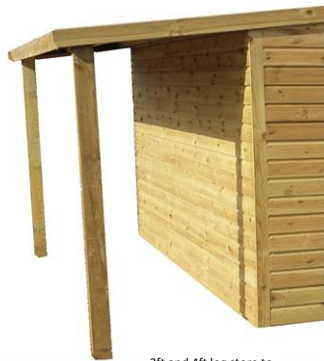
3ft and 4ft log store to side of building