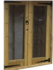
summer house paired doors full glazed - 48" wide x 70" high