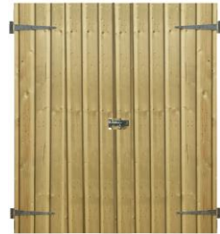
Double shed doors 54" wide - 69.5" high