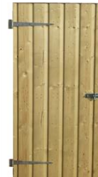
3ft wide shed door - 69.5" high