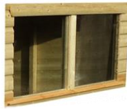
Double fixed shed window- 1200mm wide x 600mm high