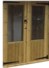
summer house paired doors 3/4 glazed- 48" wide x 70" high