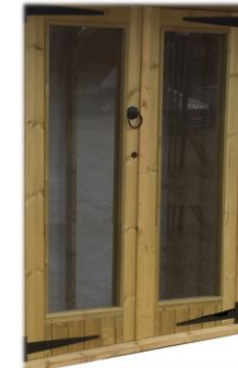
summer house paired doors full glazed - 48" wide x 70" high