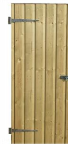
28" wide x 70" high workshop door