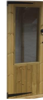
summer house single door 3/4 glazed- 28" wide x 70" high