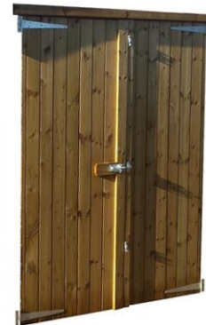
Workshop paired doors Full frame & TGV Clad- 56" wide x 70" high