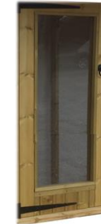
summer house single door full glazed- 28" wide x 70" high