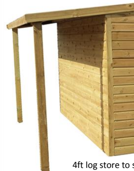
4ft log store to side of building