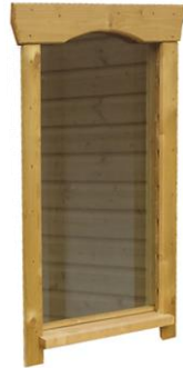
summer house window 600mm wide x 900mm high