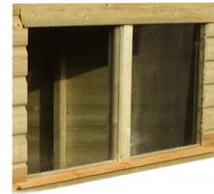
Double fixed shed window- 1200mm wide x 600mm high