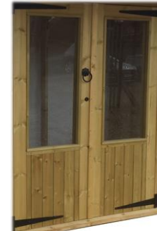
summer house paired doors 3/4 glazed - 48" wide x 70" high