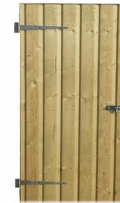
3ft wide x 70" high workshop door