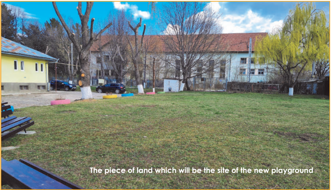
The piece of land which will be the site of the new playground

find the full detail in the brochure that comes with this Newsletter together with detail as to how you can make a difference).