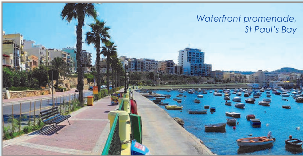
Waterfront promenade, St Paul's Bay