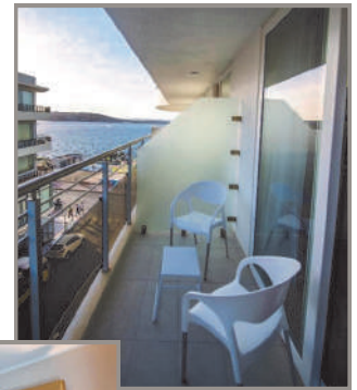
Above: lateral sea view balcony