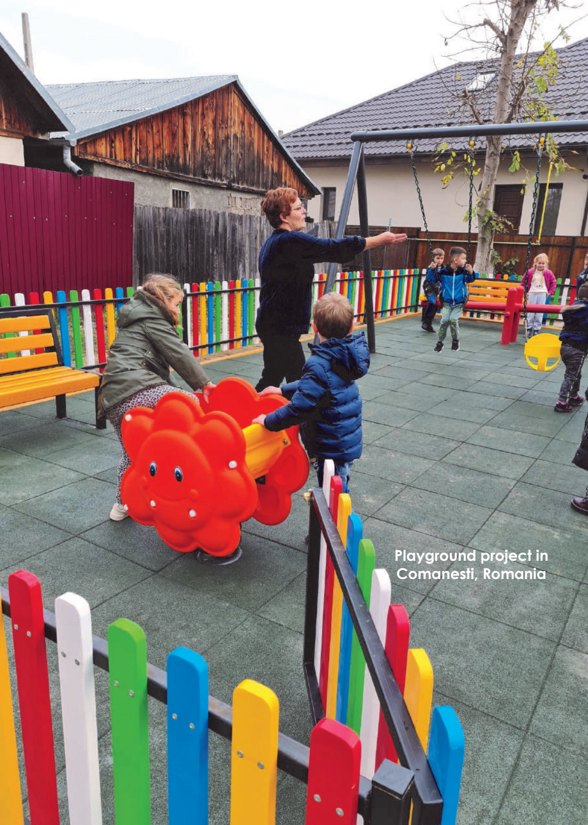
Playground project in Comanesti, Romania