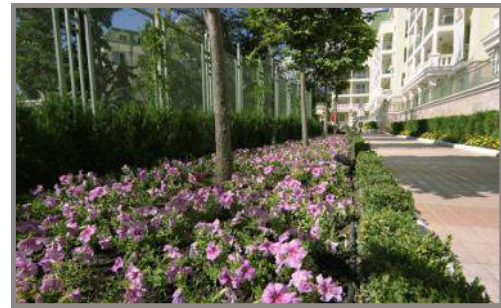
Above and right: the beautiful coast and resort of St Konstantin and Elena