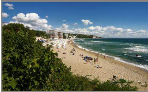
Below: Nessebar , a UNESCO heritage site