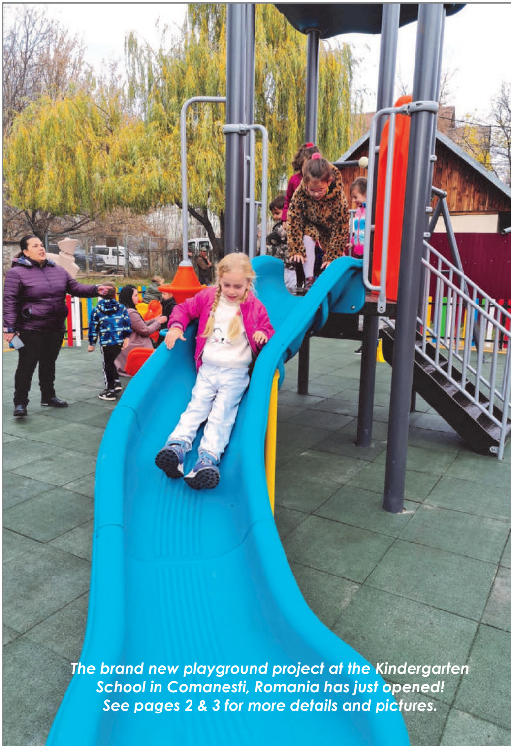
The brand new playground project at the Kindergarten School in Comanesti, Romania has just opened! See pages 2 & 3 for more details and pictures.