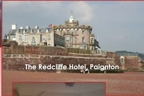
The Redcliffe Hotel, Paignton

For route planners visit the AA and RAC websites , or call the English Riviera Visitor Information Centre on 01803 211211.