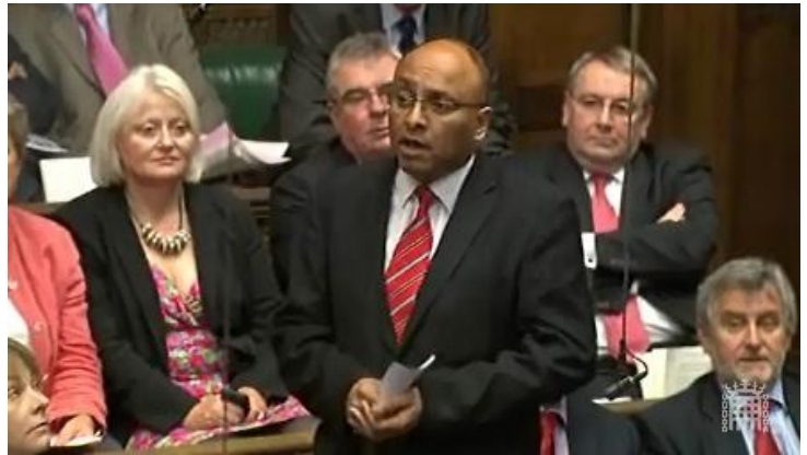
Image courtesy of the Parliamentary Archive. Parliamentary copyright images are reproduced with the permission of Parliament