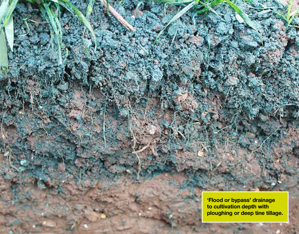
'Flood or bypass' drainage to cultivation depth with ploughing or deep tine tillage.