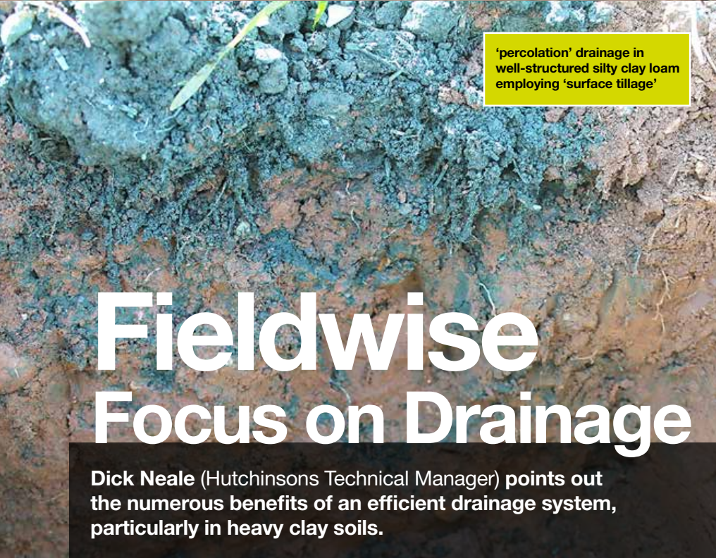
'percolation' drainage in well-structured silty clay loam employing 'surface tillage'

it's 'all over bar the shouting'. Another crop with failed patches.