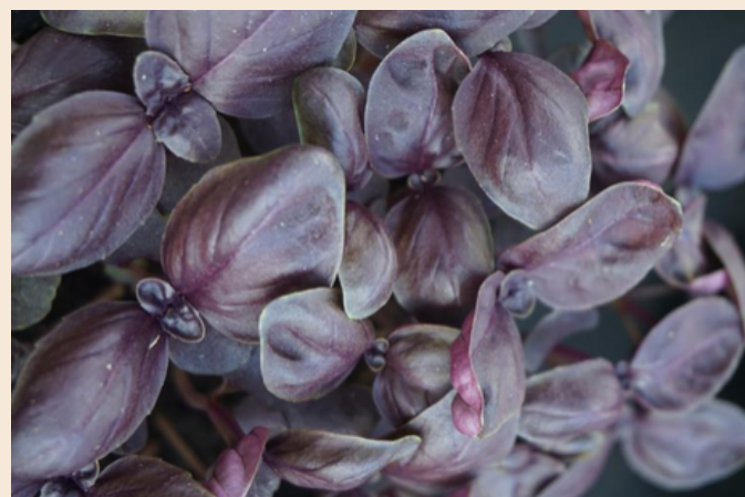
basil red rubin