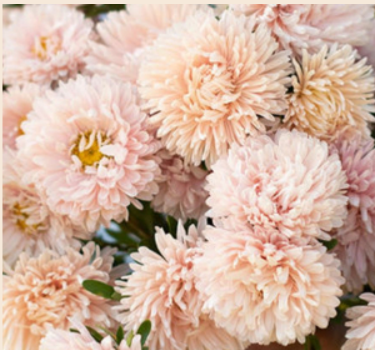
chinese aster kingsize apricot