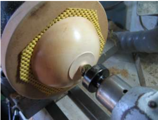
Remounted between centres to tidy up foot and spigot