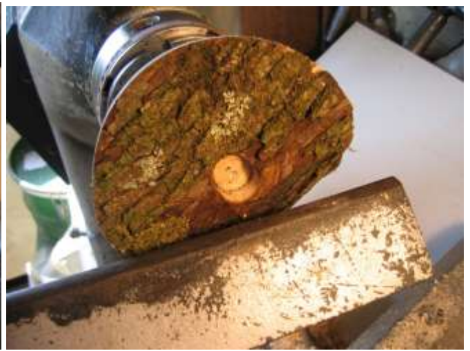
Reversed for hollowing