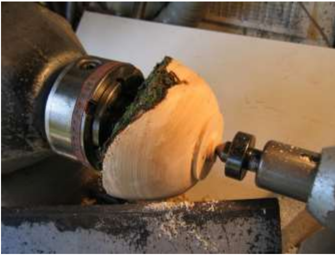
Rough shaped and spigot formed, oversize as before