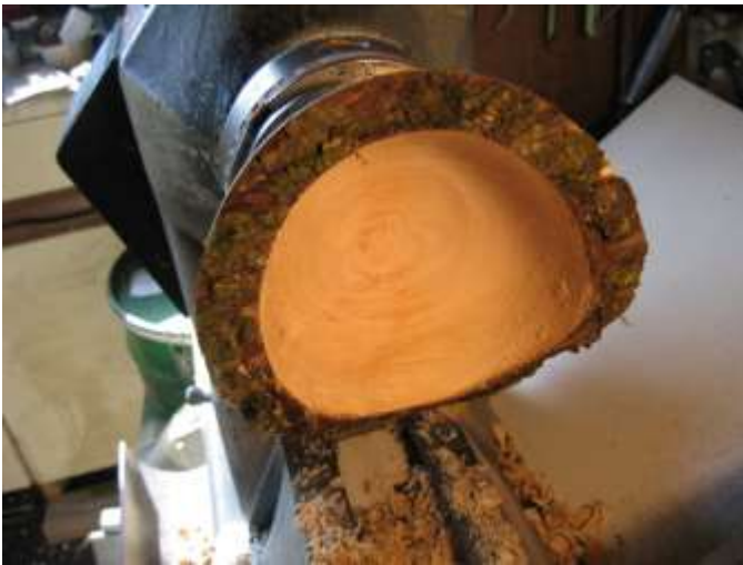
Roughed to shape, wall thickness approx 10% of dia.