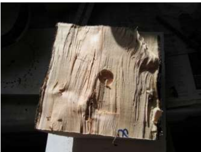
Hole drilled for ring drive