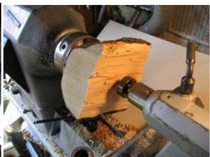
Mounted on lathe