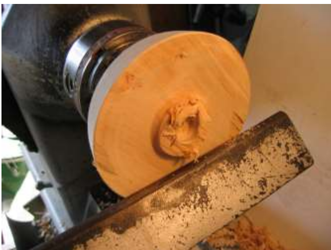
Mounted in chuck for hollowing.

Note: Make spigot as large as will fit the chuck jaws to allow for distortion and re-cutting after drying.