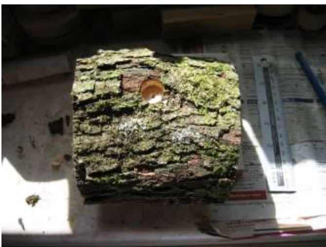
Second blank drilled with drive on bark side