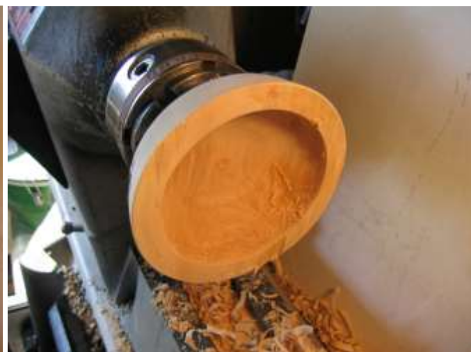
Roughed to shape, wall thickness approx 10% of dia.