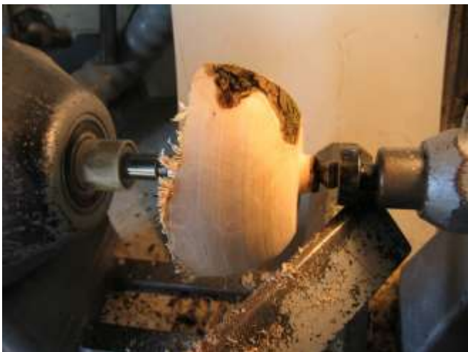
Roughed to shape

I did not bother to take corners off on a blank as small as this. Just be aware of the corners and make sure you keep the correct side of the tool rest.