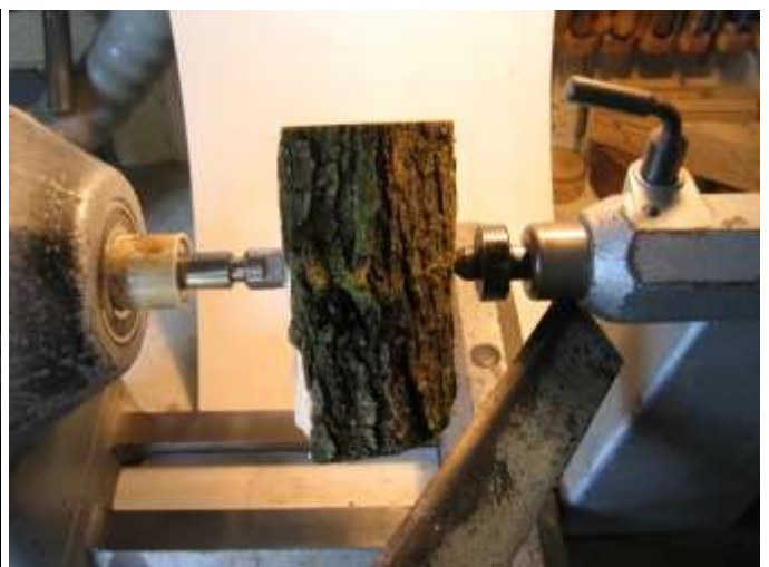
Mounted on lathe