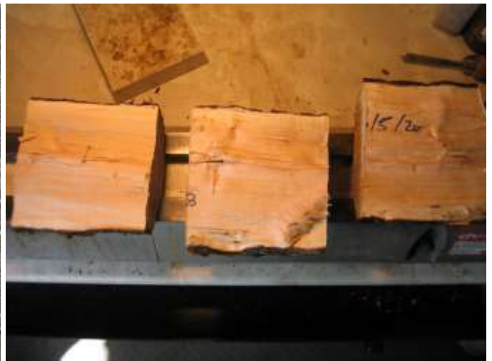
Yield - 3 pieces approx 6" square