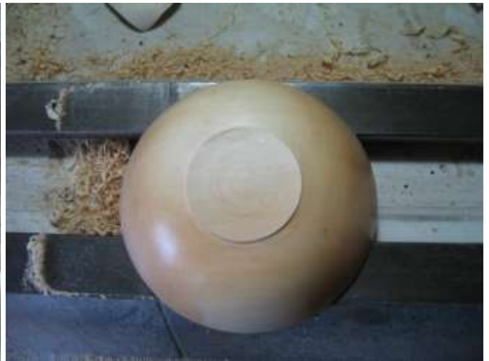
Remaining stub removed