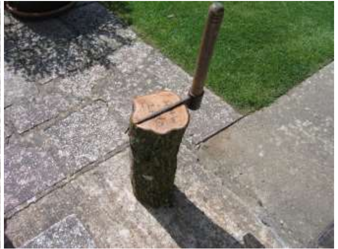
Splitting the log