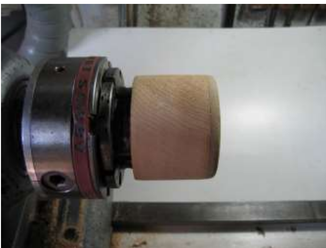
Scrap wood with soft face for remounting

Weigh bowls and note weight on base, keep in a cool dry place reweighing about every month. When weight stabilises bowls are in equilibrium with current location. 4-6 months depending on size. Bowls will have changed shape, gone oval. The spigot will need truing before re-turning.