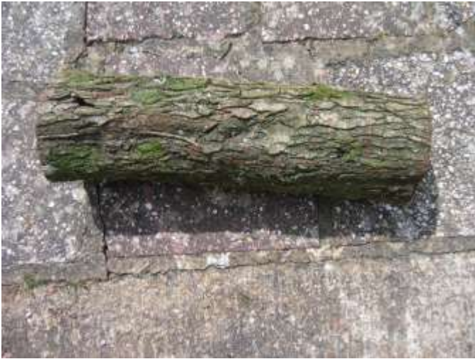
Hawthorn log Approx 20" x 6"