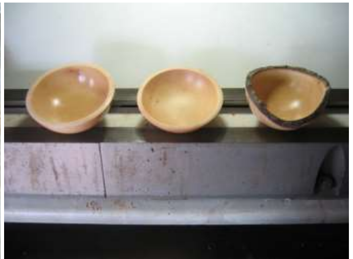
Three small bowls finished