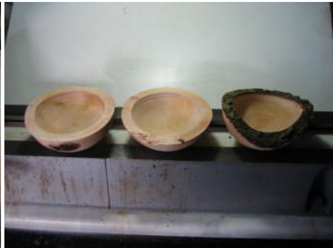
3 roughed out bowls drying

Weigh bowls and note weight on base, keep in a cool dry place reweighing about every month. When weight stabilises bowls are in equilibrium with current location. 4-6 months depending on size. Bowls will have changed shape, gone oval. The spigot will need truing before re-turning.