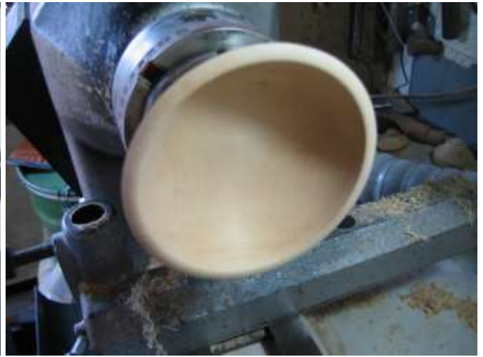
Remounted on spigot and inside finished