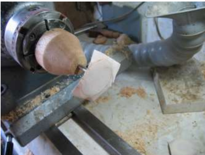
Sanding pad in lathe to finish bottom.