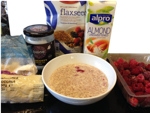
1 Coconut & raspberry porridge

What does a ketogenic meal look like? Three meals providing 6gCHO & 60g Fat: