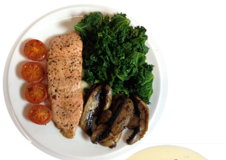
3 Pan fried salmon, kale and mushrooms plus raspberries and double cream