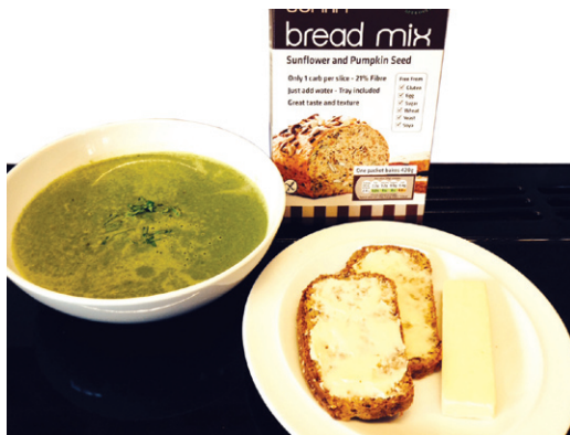
2 Watercress soup, Sukrin bread and cheese.