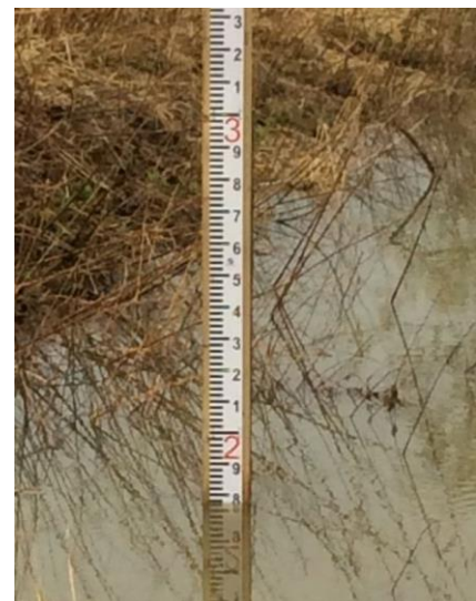
Alne Parish Council 24-Feb-2022