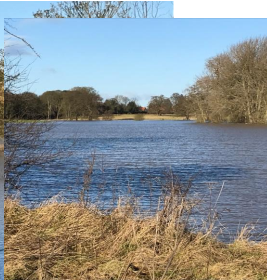
Alne 'Lake' - looking north from the road to Tollerton from Alne