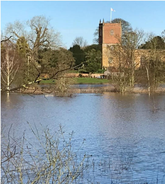
Alne Church from the south