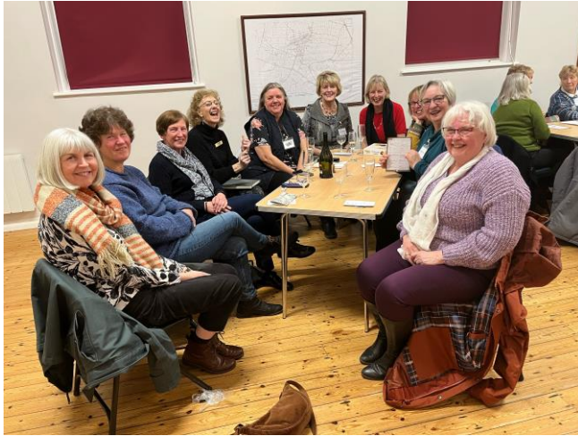
The winning table.